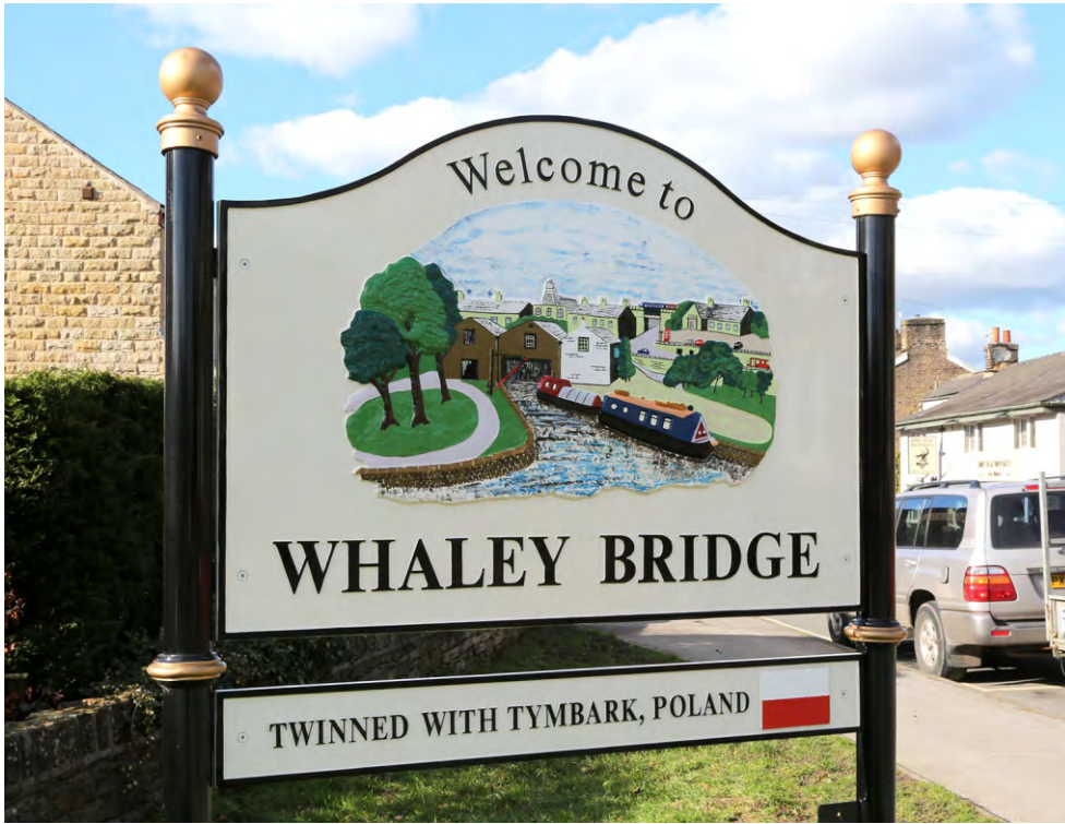
Four more examples of cast relief village and town signs

All vary widely in shape and size but the end result is something distinctive, attractive and long-lasting.