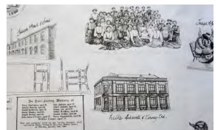
Just a small part of an incredibly detailed drawing prepared for us by Sarah Brindley as the artwork for an etched bronze on the history of hat-making.

Part of a very large 3-D reconstruction in cast metal of the canal basin at Bugsworth, Derbyshire showing how the now tranquil site was once a hive of heavy industry. The topography and buildings were cast as one with the trains and boats cast separately. Once out on site, the model canal duly filled with water!