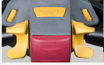
All controls - lift//lower, travel, and horn-accessible from either side of the handle for left- or right-handed operators.