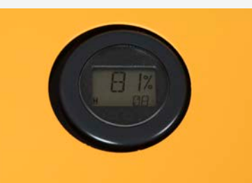
Battery discharge Indicator with lift interrupt prevents over-discharging of the battery to protect electrical components.