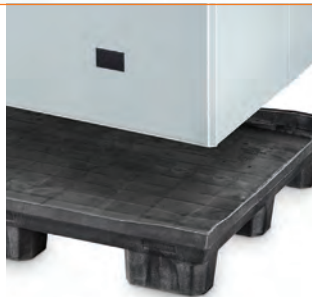
CabCube 2.0 (with closed pallet deck)

A STRONG INJECTION MOULDED THREE-PIECE PALLET BOX. IDEAL FOR SAFE TRANSPORTATION OF BULK AND LARGE VOLUME PRODUCTS.