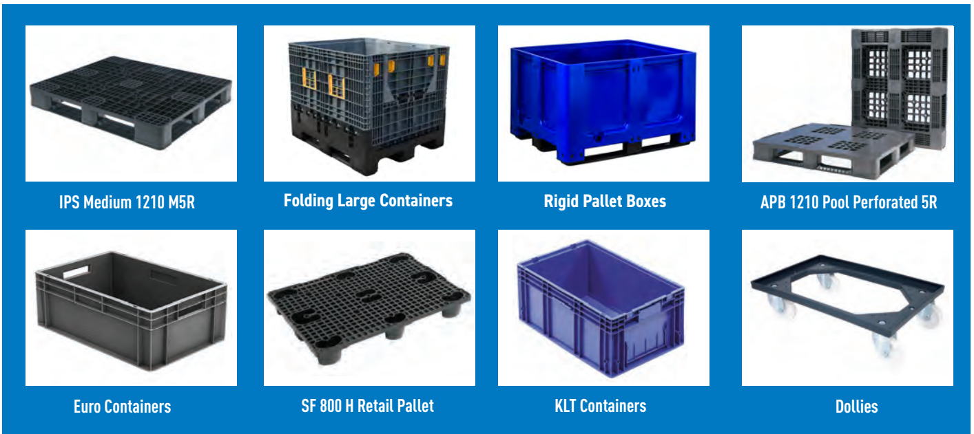
IPS Medium 1210 M5R

WE ALSO STOCK A FULL RANGE OF PALLETS, PALLET BOXES AND TOTES