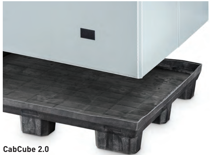
CabCube 2.0 (with closed pallet deck)

WE ALSO STOCK A FULL RANGE OF PALLETS, PALLET BOXES AND TOTES