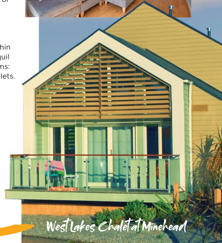
West Lakes Chalet at Minehead

For info on Harrogate accommodation please see separate brochure.