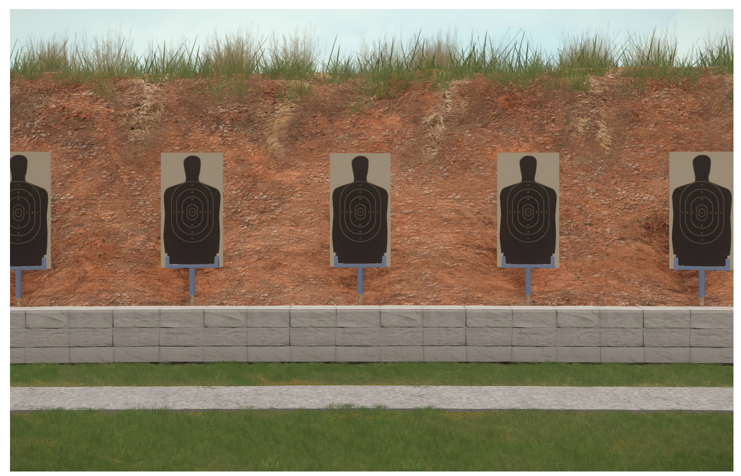
Marksmanship training and shot analysis identifies errors in shooting fundamentals