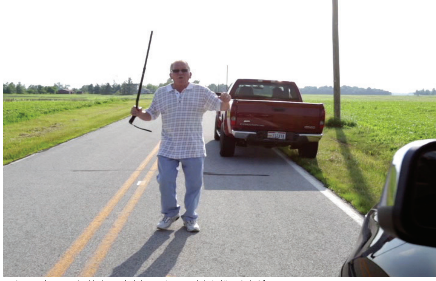
Judgmental training highlights verbal de-escalation with lethal/less-lethal force options

• Surround Sound – The self-powered audio system plays scenarios in 5.1 surround sound. Using the directional sound effects board, the instructor can incorporate unsettling sounds from any direction, including a barking dog, crying baby, gunshots and more to elevate situational awareness.