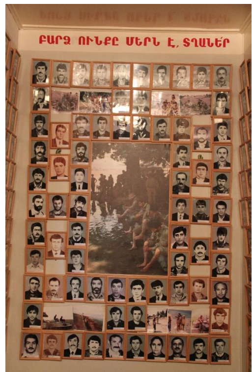
A small section of photos of the soldiers killed in the war at the Memorial for Fallen Soldiers

Therefore, it will be important for OSCE to increase the number of monitors to be able to discharge their duties effectively, and close to the frontline, to help to deter future attacks, and to gather evidence of any aggression. There have been requests to increase the number of monitors; however it is possible this will only be a token increase.