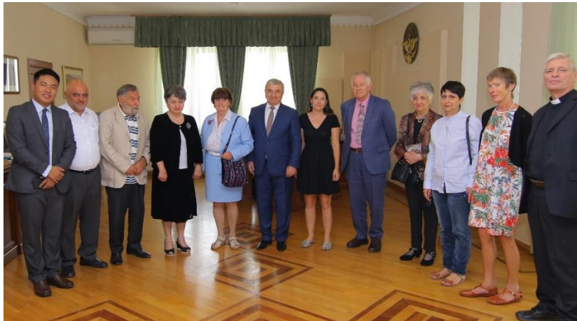
HART delegation meeting Ashot Ghouljian, the President of the National Assembly of Artsakh