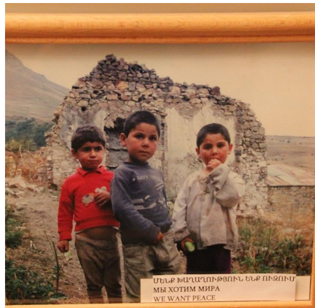
Photograph from the memorial for Fallen Soldiers titled 'We Want Peace'

Humanitarian Aid Relief Trust Unit 1 Jubilee Business Centre 213 Kingsbury Road London NW9 8AQ