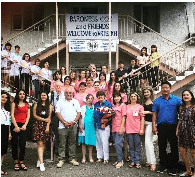
Welcome at The Lady Cox Rehabilitation Centre