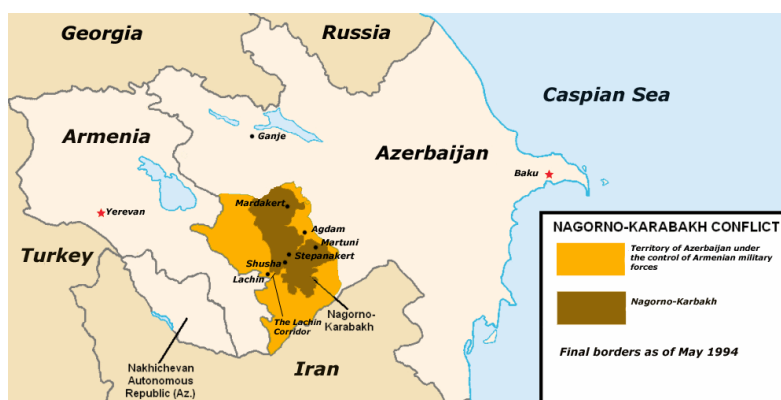
Map of Nagorno-Karabakh

Nagorno-Karabakh is a historically Armenian land but now a disputed territory since Stalin located it as an oblast in Azerbaijan without considering the will on the people of Nagorno-Karabakh, who never came to terms with that imposed reality and wanted to restore historical justice. In 1991, with the collapse of the Soviet Union (USSR), Azerbaijan initiated full-scale war resulting in the deaths of about 30,000 people 1 until a ceasefire was brokered by Russia in 1994. Since this time, Nagorno-Karabakh has struggled for international recognition of Statehood and Azerbaijan has continued to argue the case of its territorial integrity.