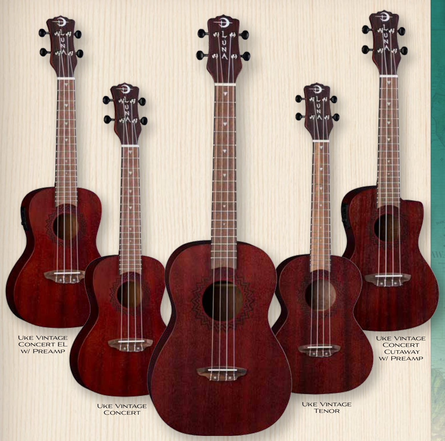
UKE VINTAGE BARITONE