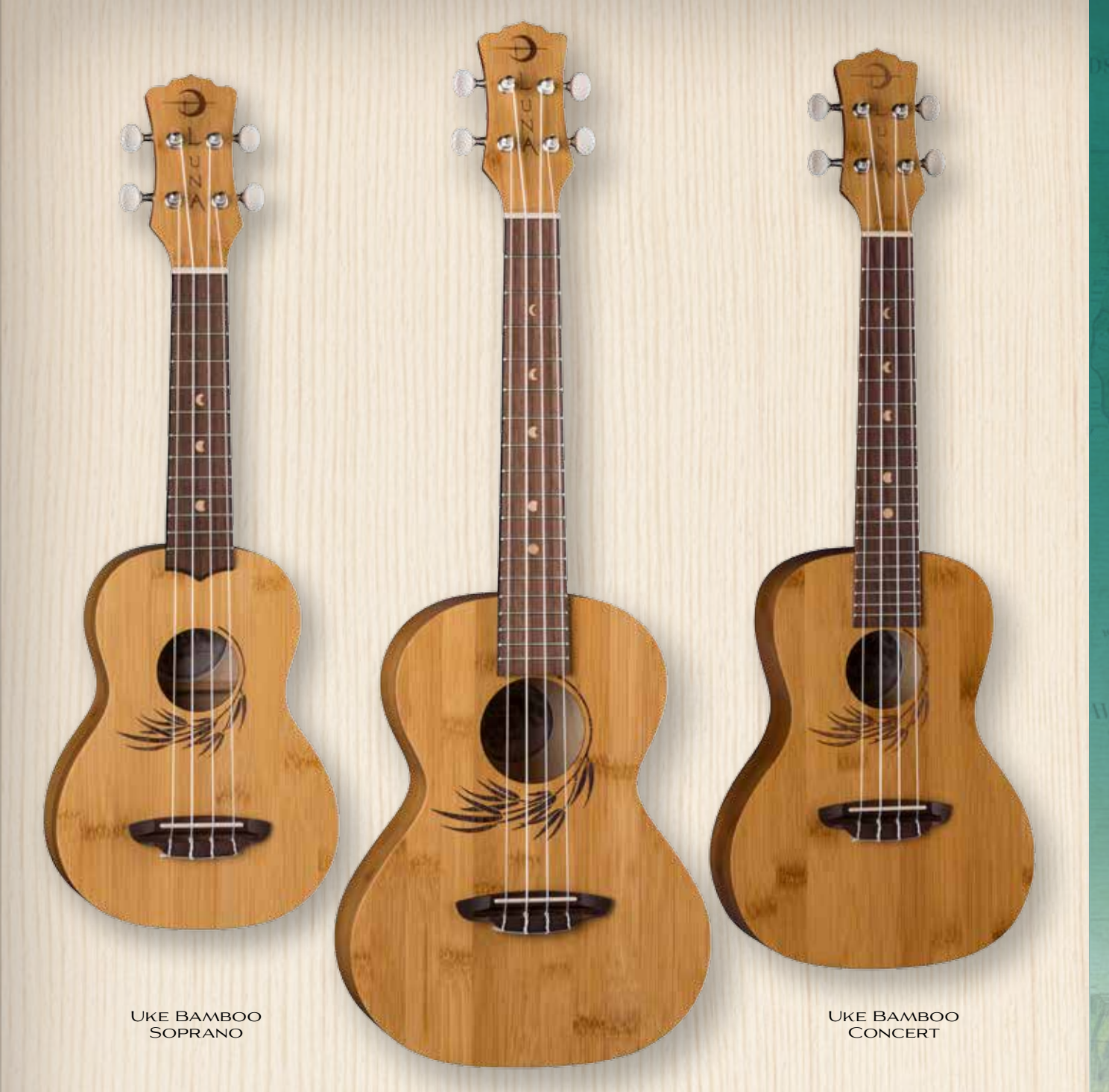
UKE BAMBOO TENOR