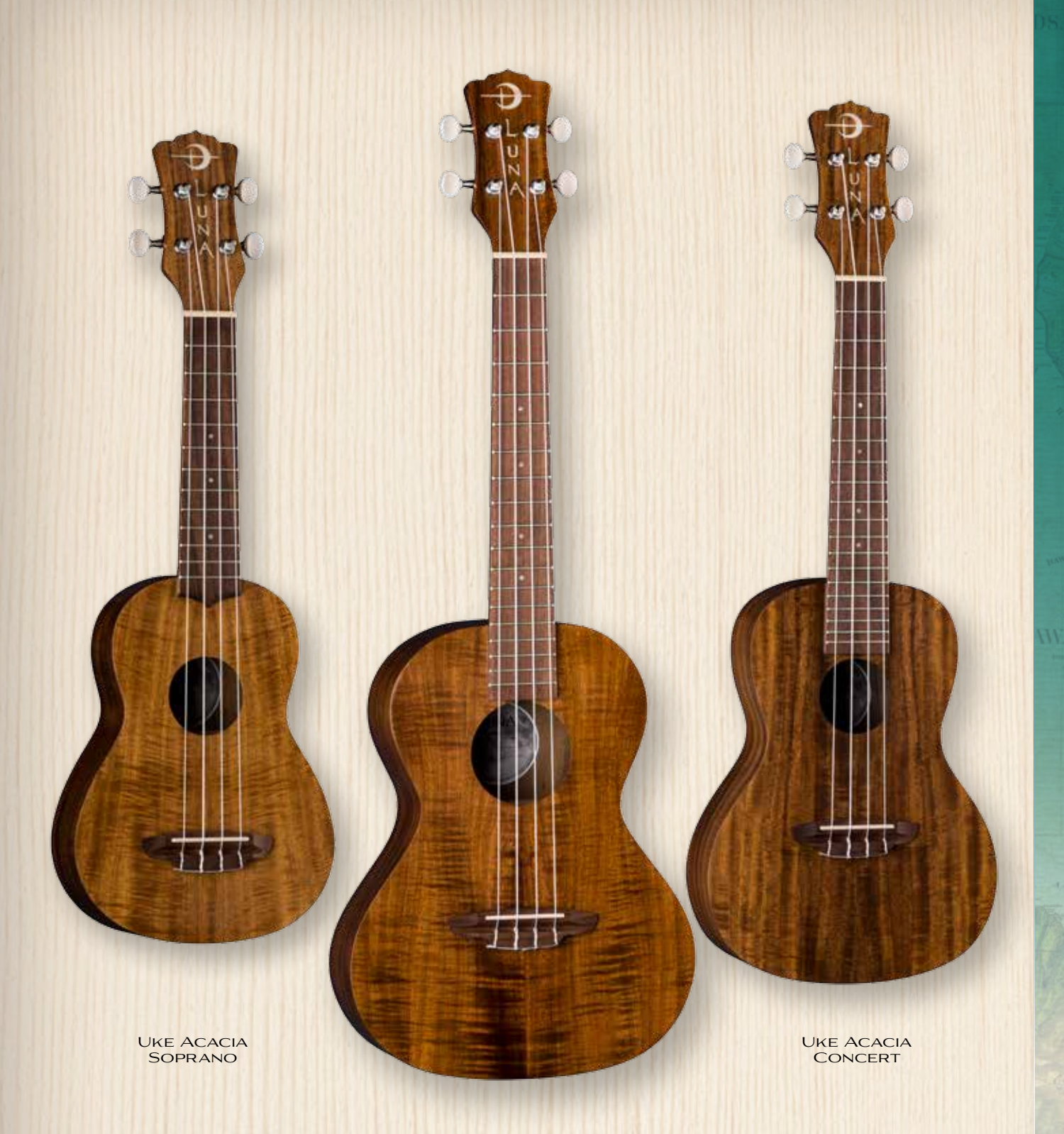
UKE ACACIA TENOR

Acacia wood is a proven favorite among uke enthusiasts for its warm sounding tone, sturdy construction and close similarities to the popular KOA wood. The Luna Acacia Wood Series is an eye-catching line of exotic ukuleles that sound as amazing as they look!