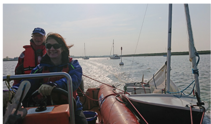
RYA Safety boat training

Powerboating If you prefer to get afloat aboard something a little dryer, we run powerboat courses in the Spring and Autumn. These 2-day courses provide the