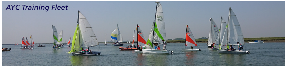
AYC Training Fleet