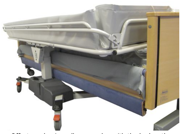
Offset mechanism allows overlap with the bed so the carer does not have to reach and allows use in the smallest of rooms