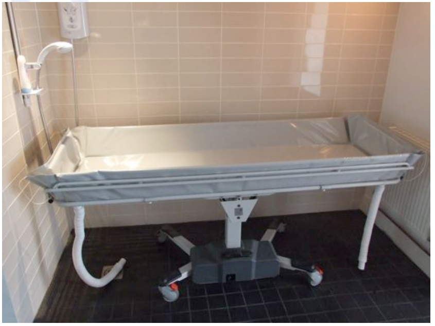
The shower trolley was small enough to fit into the recessed wet area

The OpeMed shower trolley is available in 3 different lengths (1600, 1900, 2100mm), and due to the mechanism being offcentre, can be positioned over the bed for easy transfer on or off.