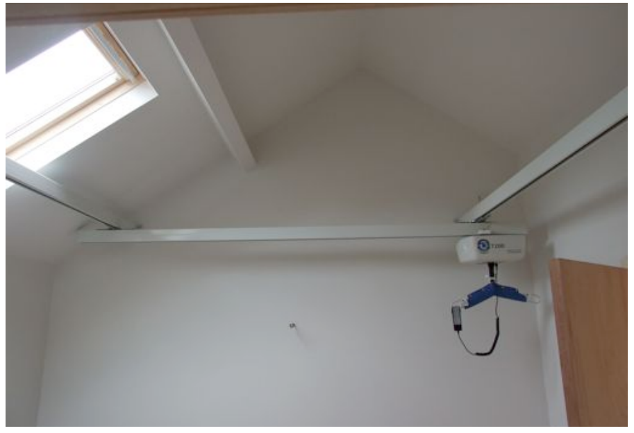
Large H system fitted on wall brackets

The client was keen with their new extension to cause minimum disruption to their design, and for the ceiling hoist to blend in as much as possible, this is where the compact design of the white motor and track from OpeMed excelled.