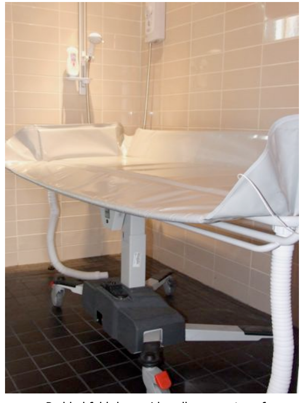
Padded fold down sides allow easy transfer