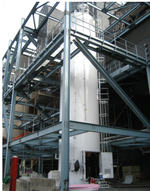
Activated Carbon Injection for Mercury Control

DSI systems are comprised of three basic components; material handling equipment to unload and store sorbent (lime, trona, sodium bicarbonate or PAC); pneumatic conveying systems to transport the sorbents from storage to ductwork inspection points and duct work injection to introduce the sorbent into the flue gas stream. Delta Wing® DSI provides the essential benefit of proactively mixing the sorbent with the flue gas to improve system efficiency and sorbent utilization. Babcock Power Environmental accomplishes this important addition by applying its proprietary Delta Wing® mixing technology to aggressively and evenly mix the sorbent with the flue gas in the ductwork.