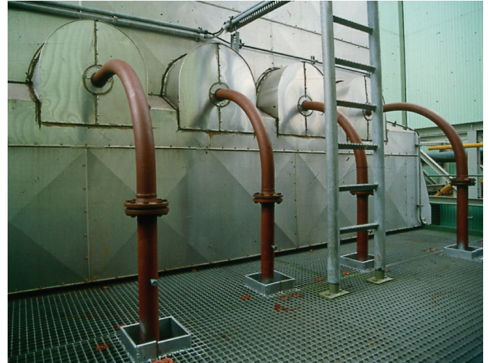
Simpler Injection System

*Babcock Power Environmental's affiliate, Riley Power Inc., also a Babcock Inc. company, offers the same proprietary-based technology, Delta Wing® DSI system, to its customers.