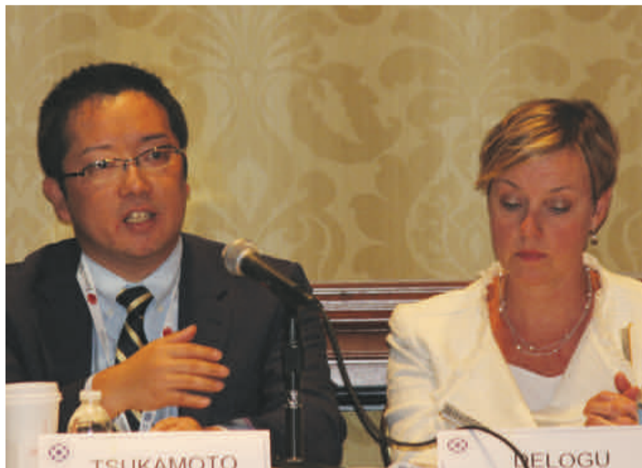
Progress made, but still a way to go

"There's room for debate on whether any particular condition, as it applies to you, qualifies"