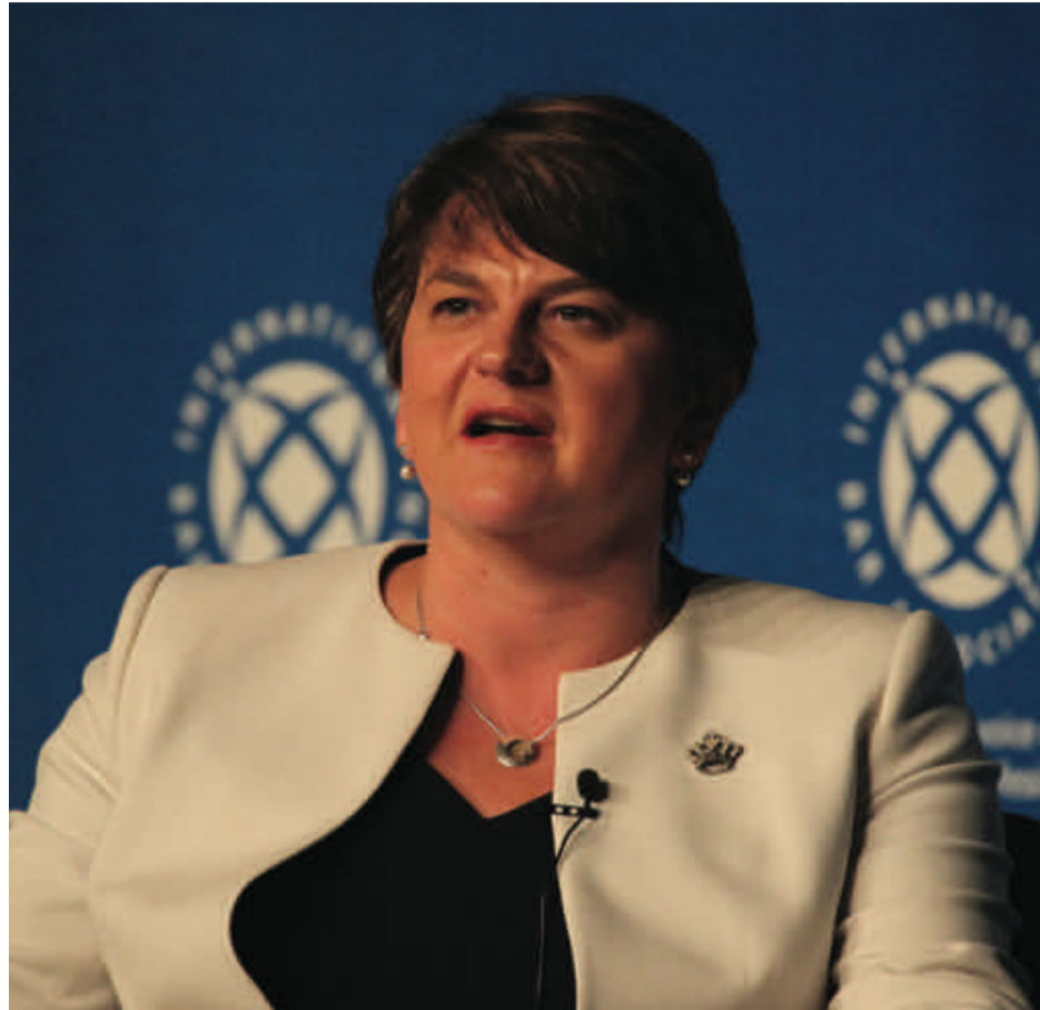
Rt Hon. Arlene Foster, MLA

Foster certainly knows about conflict. She has a deep-rooted background in Northern Irish political life, including the so-called Troubles, the period of civil strife that blighted Northern Ireland for many years. "I was born in 1970 and that was literally at the start of the euphemistically-called Troubles," she said. Her experience of that conflict quickly became personal: