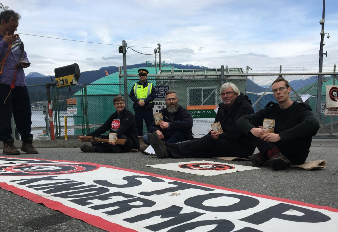
Participants sit in the midst of a protest against the Kinder Morgan Trans Mountain Pipeline.