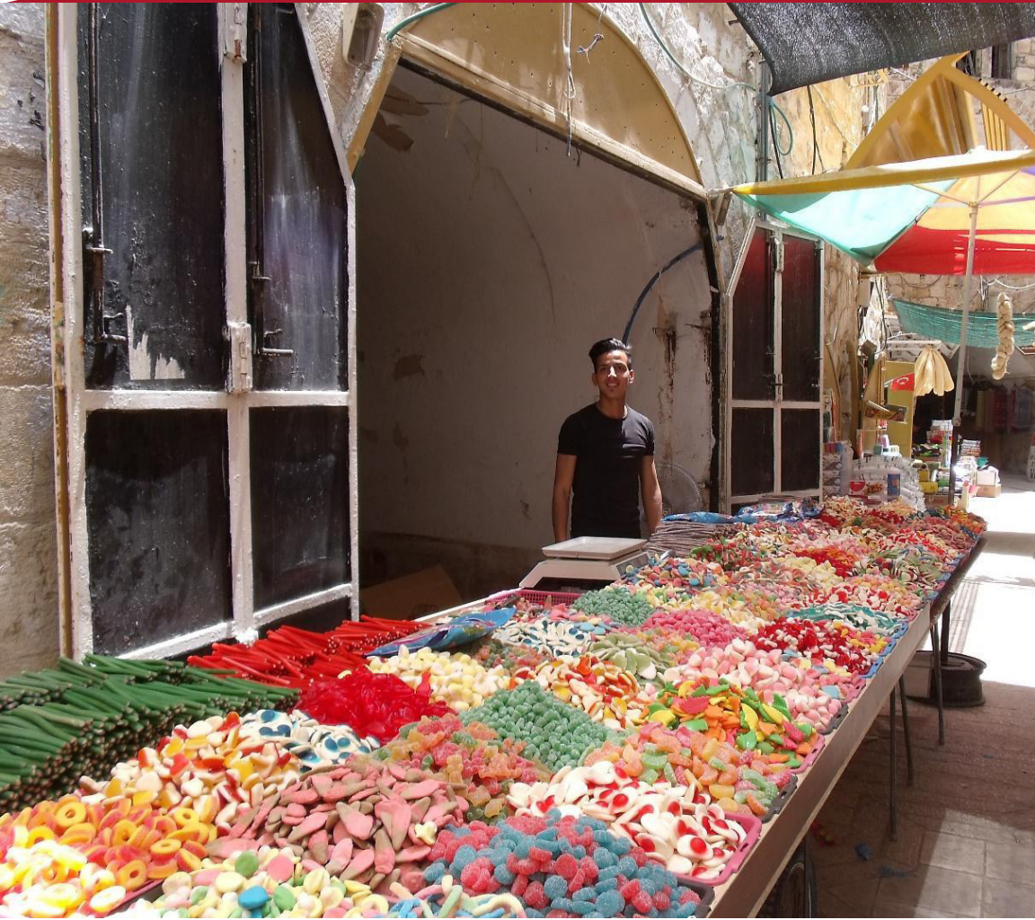
A vendor in the Souk offers a wide array of colorful sweets for Ramadan.

women and children who flock to the Ibrahimi Mosque, especially on Fridays for the noon prayer.