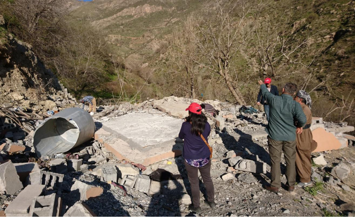
A villager from Sarkan telling CPTers about the bombing by the Turkish warplanes.