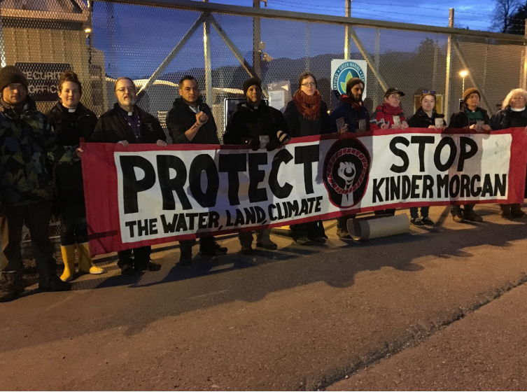
Pictured: CPTers and partners at a protest against the Kinder Morgan Trans Mountain Pipeline.