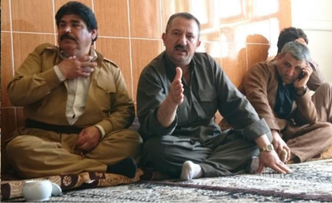
The father of one of the bombing victims telling CPTers about his son.

anger and sadness, she told CPT that no one is stopping Turkey from killing Kurdish people.