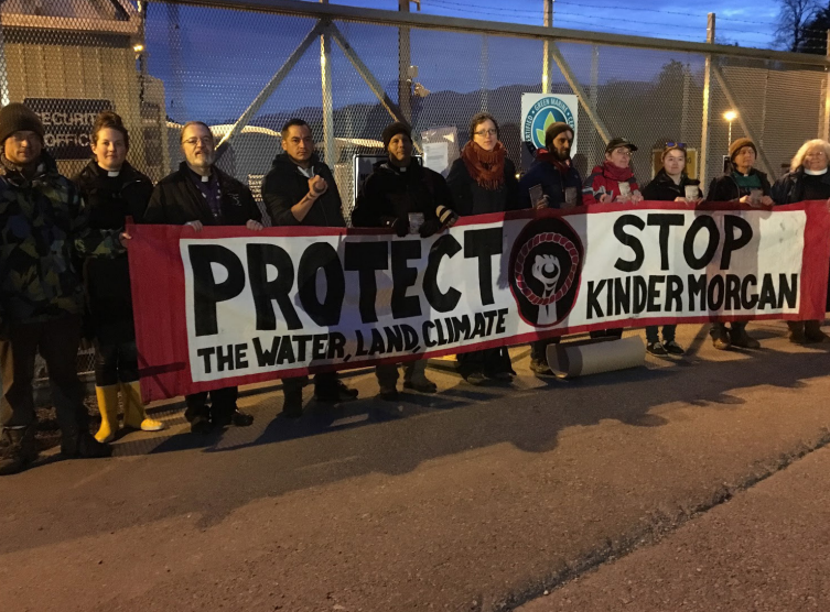
Pictured: CPTers and partners at a protest against the Kinder Morgan Trans Mountain Pipeline.