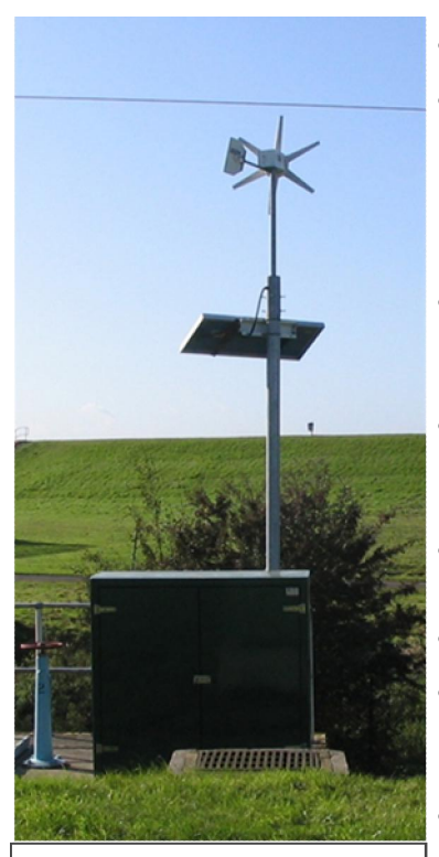
A low energy remote power site where a grid connection would otherwise cost thousands of pounds