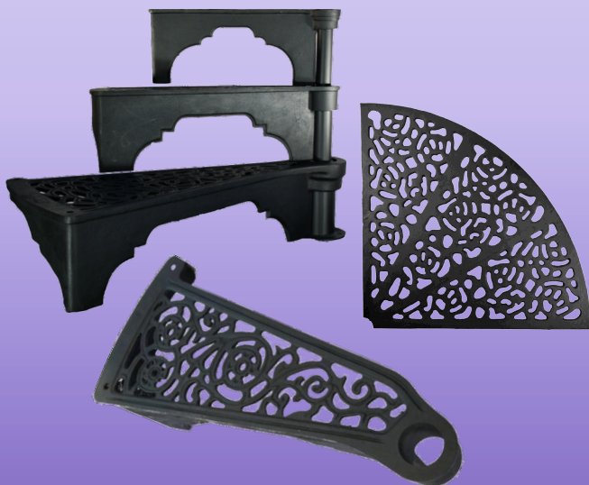
Treads and landing plates