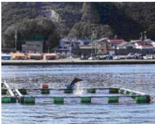
A dolphin leaps in a holding pen in Taiji.

A memo circulated by Japan's Cetacean Conference on Zoological Gardens and Aquariums in August 2005 and written by the conference's Executive Secretary asked aquarium directors to complete a questionnaire to determine the extent to which aquaria want to display Pacific white-sided dolphins, a species not currently targeted by drive hunts, so the results could be used to justify a permit application for their capture at Taiji. 84 The memo also referred to the need for discussion between fishermen and aquaria to only capture dolphins wanted for captivity. Taiji's plans to expand its use of small cetaceans, a five-year " Community Development Plan by Whale People using Whales ", has been approved by the Japanese Government under Japan's Local Revitalisation Law, which entered into force in April 2005. 85