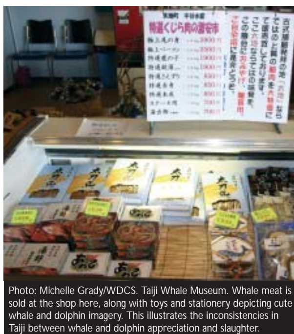
Taiji Whale Museum. Whale meat is sold at the shop here, along with toys and stationery depicting cute whale and dolphin imagery. This illustrates the inconsistencies in Taiji between whale and dolphin appreciation and slaughter.

Additionally, it is possible to determine diet from non-lethal research techniques, such as faecal analysis, by which scientists can determine through genetic testing what prey the whales have eaten and even what intestinal parasites they carry. 62