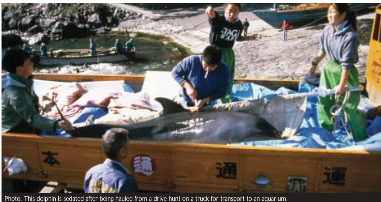
Photo: This dolphin is sedated after being hauled from a drive hunt on a truck for transport to an aquarium.