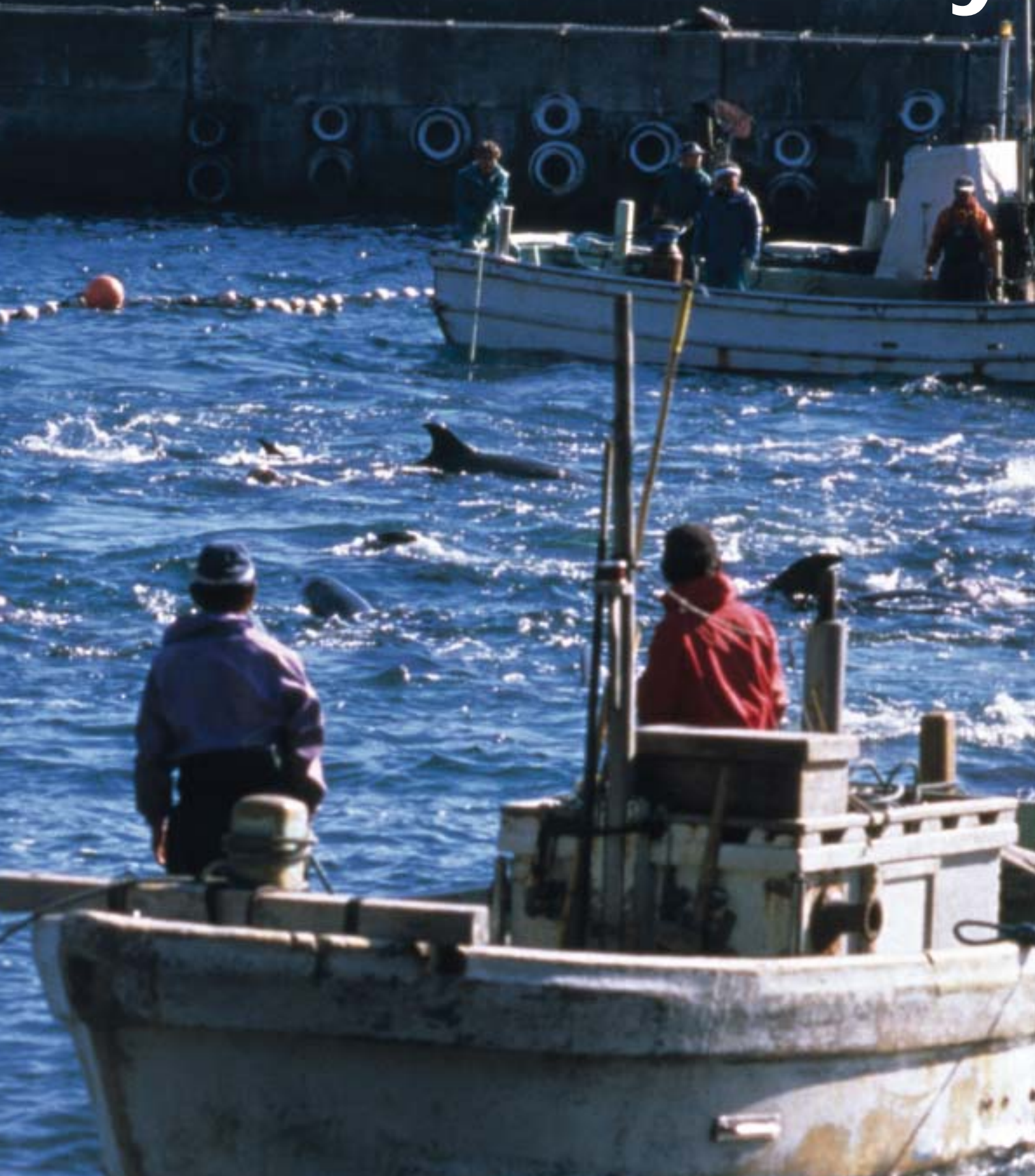
Photo: Boats surround dolphins during a drive hunt in Futo.