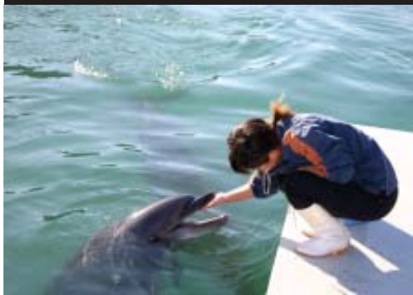
At Iruka (dolphin) Park, a facility run by the Katsumoto Fishing Cooperative, a trainer commands a dolphin acquired through the drive hunts.