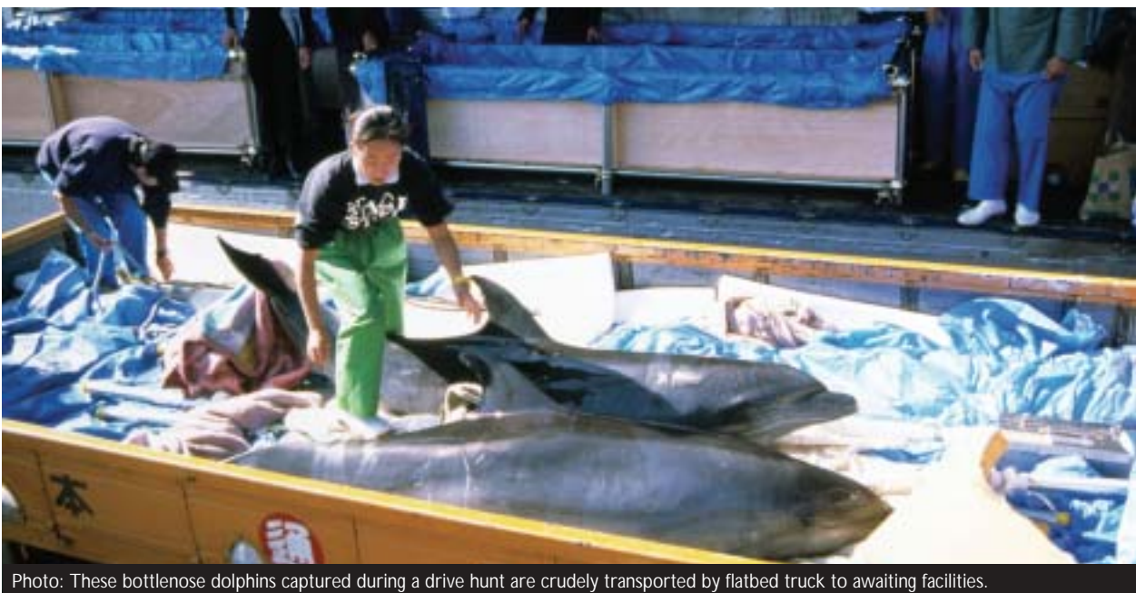
Photo: These bottlenose dolphins captured during a drive hunt are crudely transported by flatbed truck to awaiting facilities.

Divers hold the chosen dolphins at their sides and lift them onto a special dolphin stretcher, which has holes for dolphins' pectoral fins, that is lowered into the water level by a crane. Once a dolphin is properly ensconced, the crane lifts it onto a truck that the aquariums have waiting on the pier. Aquarium personnel immediately remove the stretcher, and move on to the next operation. When dolphins are taken to nearby aquariums, their transport involves placing them on wet mattresses, covering the upper parts of their bodies with cloth, and occasionally wetting them, but when destinations are far, dolphins are put in long tanks to keep their bodies immersed. In all cases sedatives are administered to keep the dolphins from struggling. On this occasion the sedative caused the shock death of one female; her belly was subsequently cut open, and the meat extracted and processed." 151