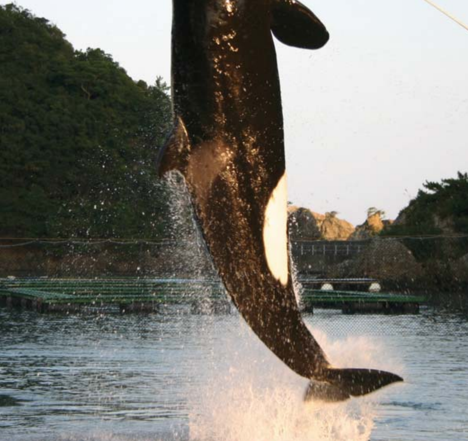
This orca, acquired in a drive hunt, performs three times a day at the Taiji Whale Museum.