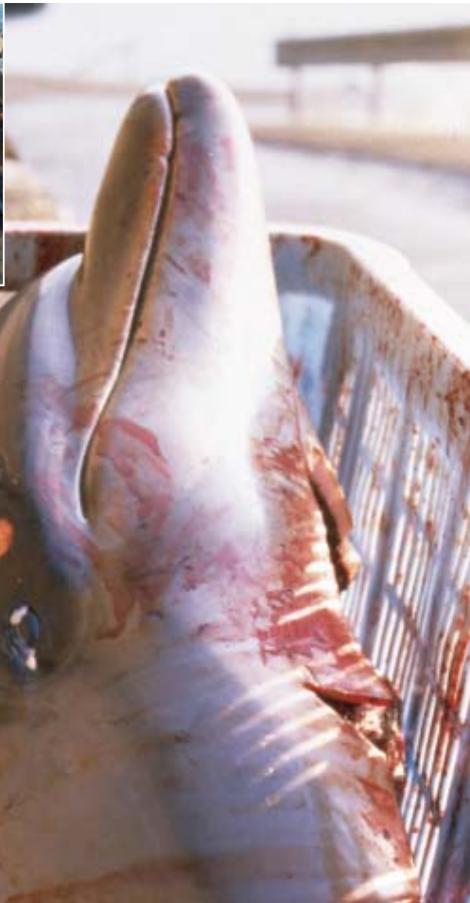
Photos: Top: Dolphin entrails and other parts serve as vivid evidence of a recent hunt. Bottom: A victim of the hunt.