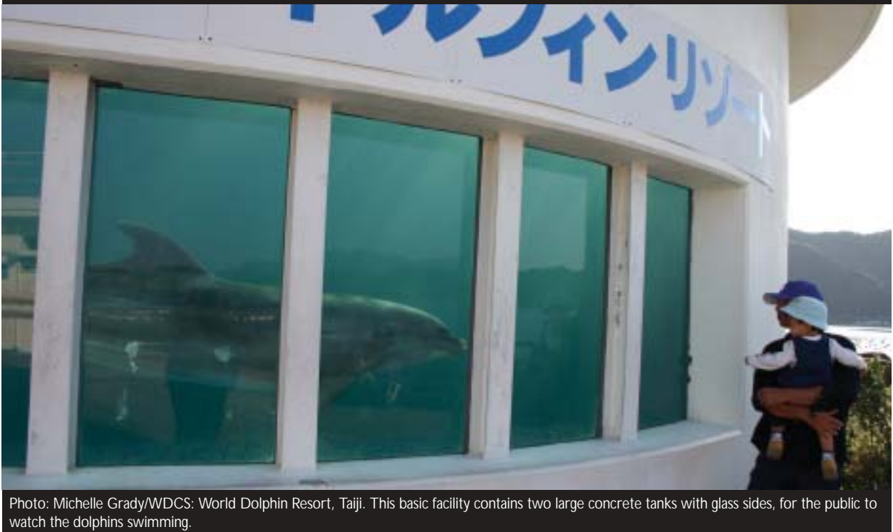
World Dolphin Resort, Taiji. This basic facility contains two large concrete tanks with glass sides, for the public to watch the dolphins swimming.