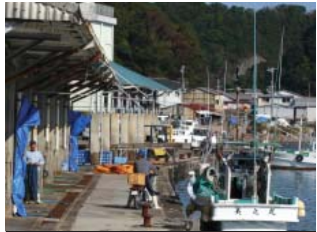
Taiji harbour and the buildings used for slaughter.

Currently, drive hunts are conducted at Futo, in Shizuoka Prefecture and Taiji, in Wakayama Prefecture, (see map). The hunting season in Futo