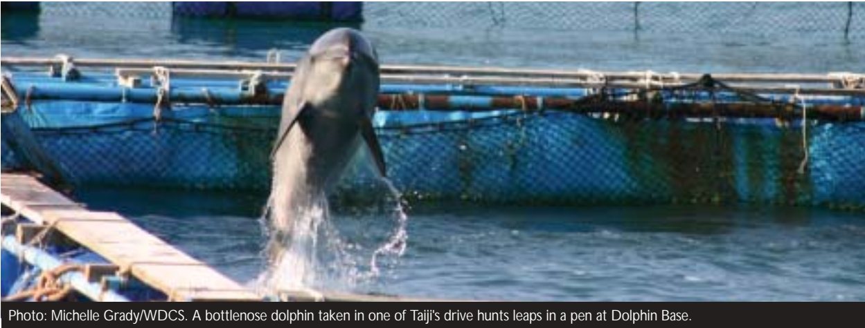
A bottlenose dolphin taken in one of Taiji's drive hunts leaps in a pen at Dolphin Base.