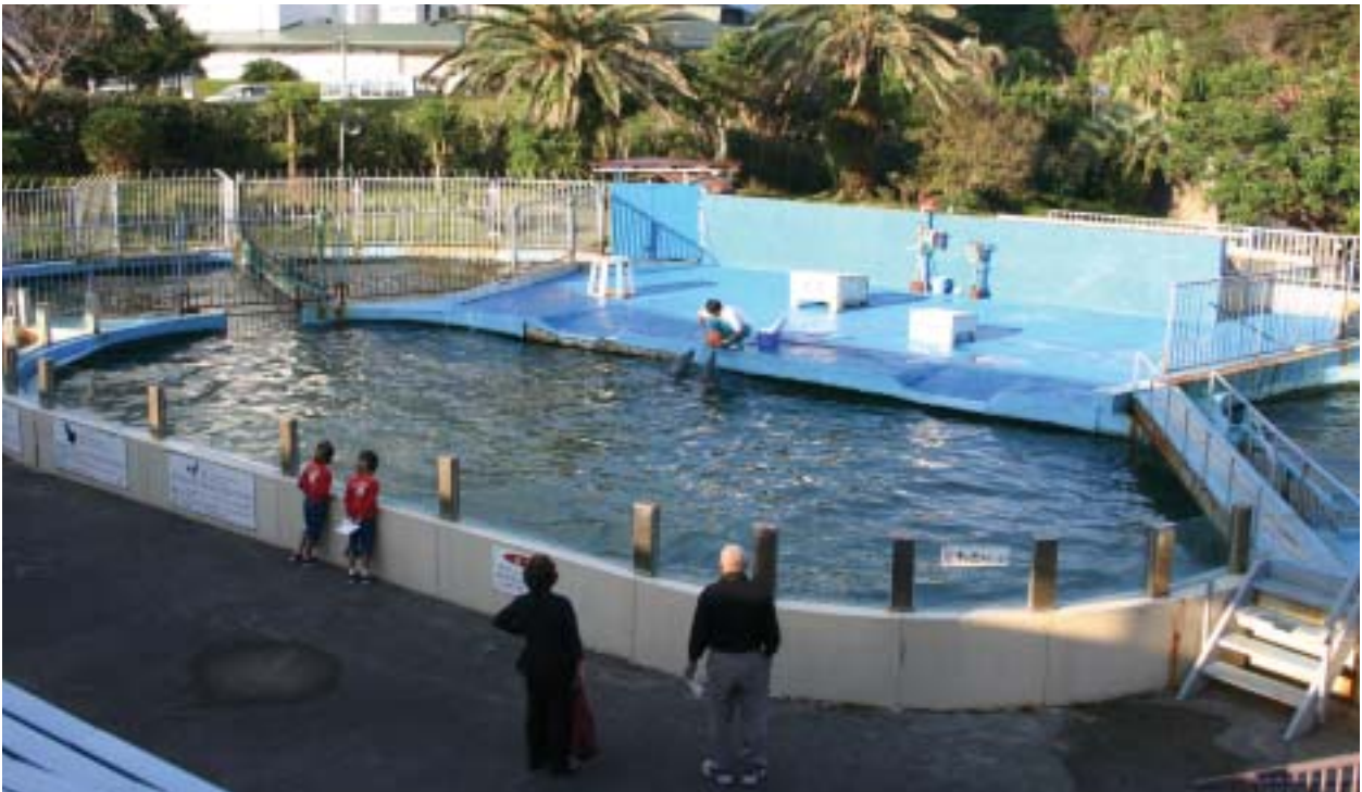
The ageing dolphin pools at the Taiji Whale Museum.

Dolphin Base. 105 In what appeared to be total disregard for the welfare of the dolphins held for several days, trainers and other aquaria representatives were seen wading into the churning waters where dolphins struggled to free themselves. Several dolphins became entangled and subsequently suffocated in the nets alongside trainers who did not intervene to assist them. 106