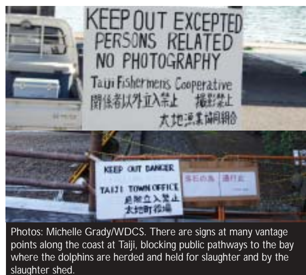
There are signs at many vantage points along the coast at Taiji, blocking public pathways to the bay where the dolphins are herded and held for slaughter and by the slaughter shed.

conservation groups documenting the hunts for broadcast, the dolphins are increasingly killed under the cover of tarpaulins or out of view in other coastal areas. 8 Access to the areas where the dolphins are slaughtered is obstructed. In Taiji, signs prohibiting photography and access to coastal routes that were once public park areas have been erected by the fishing cooperative, warning of falling rocks and other pretences to prevent the public from viewing the killing of dolphins. At Futo in 2004, fishermen, local police and Fisheries Agency officials tried to prevent the taking of video and photographs and a tent was pitched to conceal the killing. Roads to the harbour where the dolphins were being held during the hunt were also blocked with “no admittance” signs. 9 These tents, or tarpaulins, are now used as a standard part of the hunt to conceal the selection and slaughter process.