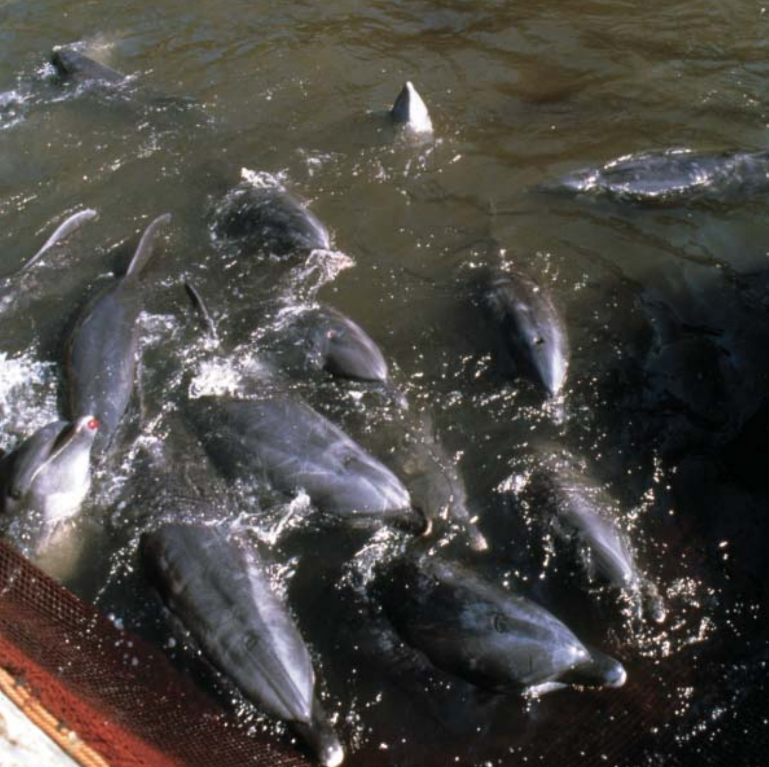
Photo: These bottlenose dolphins struggle as they are trapped by boats during a round-up in Futo.