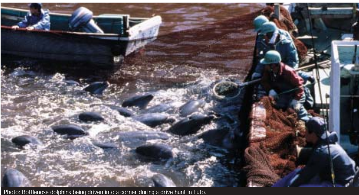
Photo: Bottlenose dolphins being driven into a corner during a drive hunt in Futo.

Despite intense international criticism of the inhumane methods of slaughter employed, and as Japanese prefectures appeared to be on the verge of abandoning the hunts, the demand for live animals to supply a growing number of marine parks and aquaria is emerging as a primary motivating factor for the drive hunts to continue in Japan. This report explores the nature of this demand and the role of the aquarium industry that purchases live animals from these hunts. This cooperation between the aquarium industry and the drive hunts is a devastating development for Japan’s dolphins.