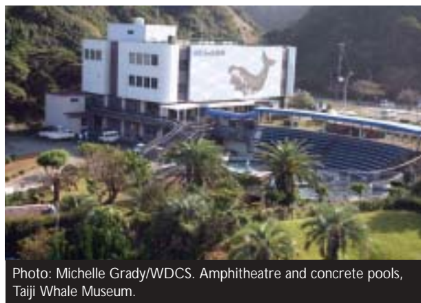
Amphitheatre and concrete pools, Taiji Whale Museum.

In October 1999, nearly 100 bottlenose dolphins were driven into Futo Harbour. 97 Reports allege that representatives from two Japanese aquaria (Aburatsubo Marine Park and Izu Mito Sea Paradise) selected six dolphins for their facilities. 98 Following selection by the aquaria, fishermen slaughtered 69 other dolphins, processing their meat at a nearby slaughterhouse. During this process, the dolphins were pulled by hooks, lassoed by their flukes with ropes, hauled from the water while they were, in most cases, still alive and transported to the processing stations. 99 The remaining dolphins were seriously harmed as they were violently forced outside the nets. 100 Footage of this hunt was shown on CNN news in the USA and was later described in a UK government report to the International Whaling Commission. Following international dissemination of the hunt footage, drive hunt fishing cooperatives were directed to alter their killing methods 101 and conceal their hunts. 102