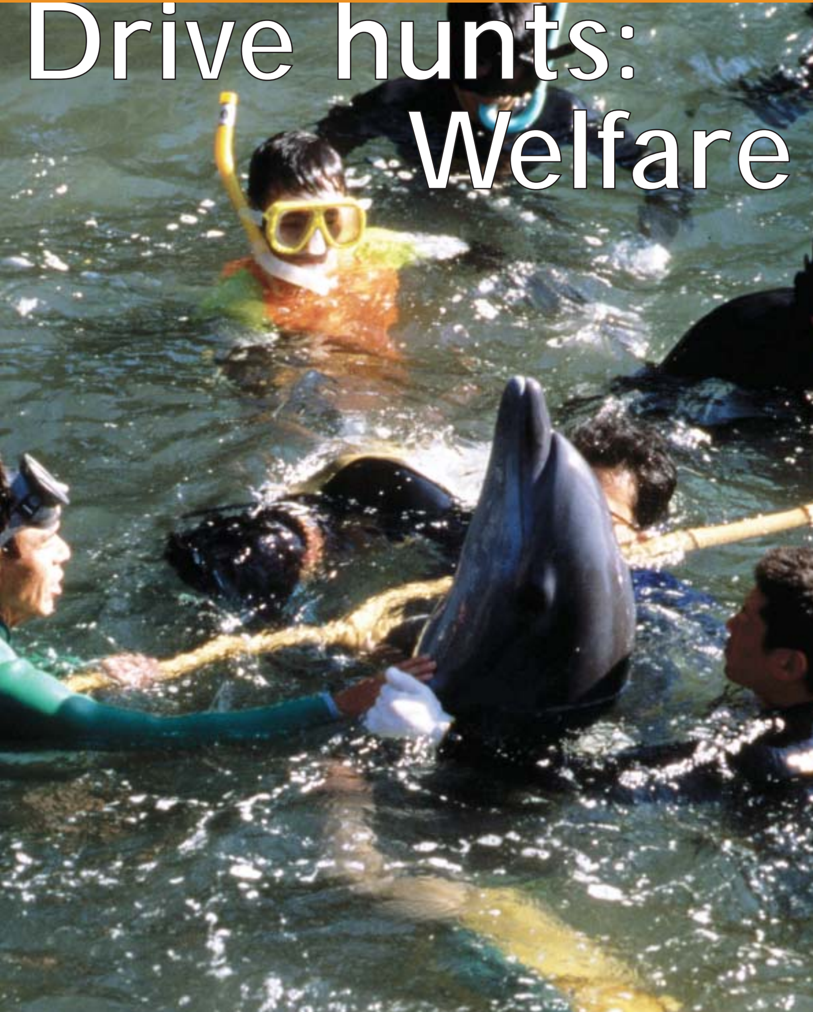
Photo: Divers surround a dolphin in the water.