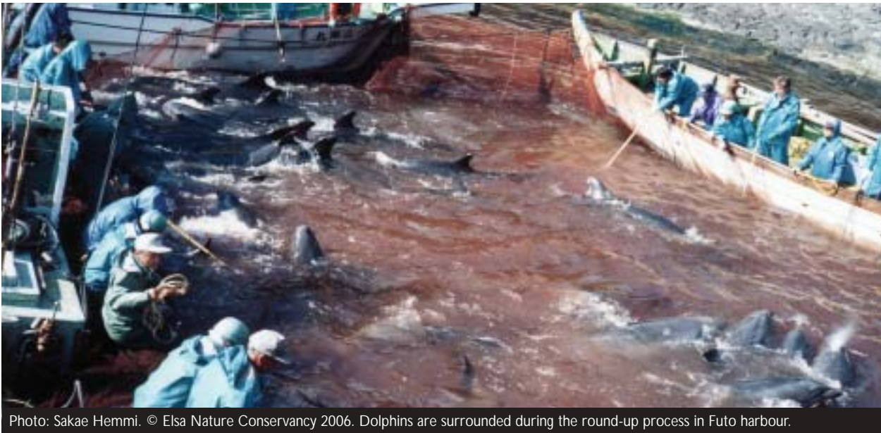
Dolphins are surrounded during the round-up process in Futo harbour.

“Drive hunts are conducted by a number of high speed boats that spot a school of dolphins or small whales at sea. The boats form a semi-circle and herd the animals to a harbor or port. Once in the port, the dolphins are surrounded by nets, which are gradually pulled tighter, trapping the animals into an increasingly confined space. The dolphins are then caught with a hook, have a rope tied around their flukes and are then lifted by a winch onto the quay or onto a truck. They are then driven to a nearby warehouse to be slaughtered.” 6