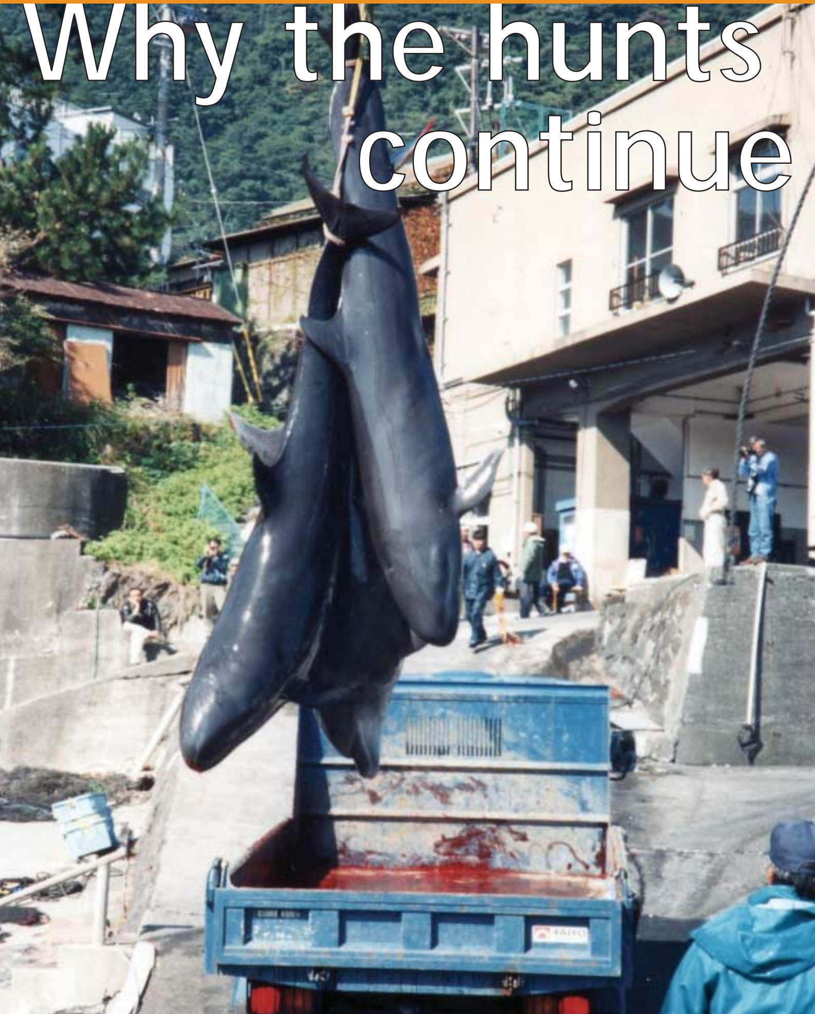
These false killer whales and bottlenose dolphin are transported alive to the nearby slaughterhouse.