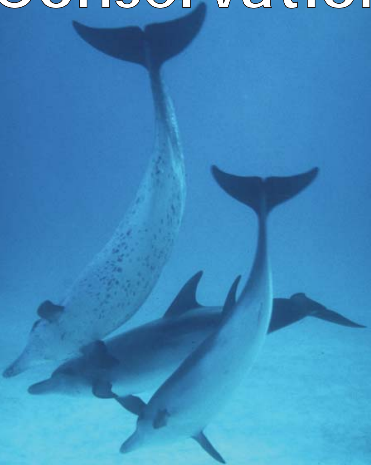
Spotted dolphins.