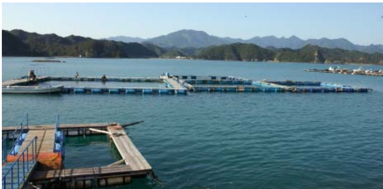
In the bay at Taiji are training pens belonging to Dolphin Base. Dolphin Base has an active training programme and reports suggest it provides dolphins and training resources to aquaria throughout Japan and overseas. 103