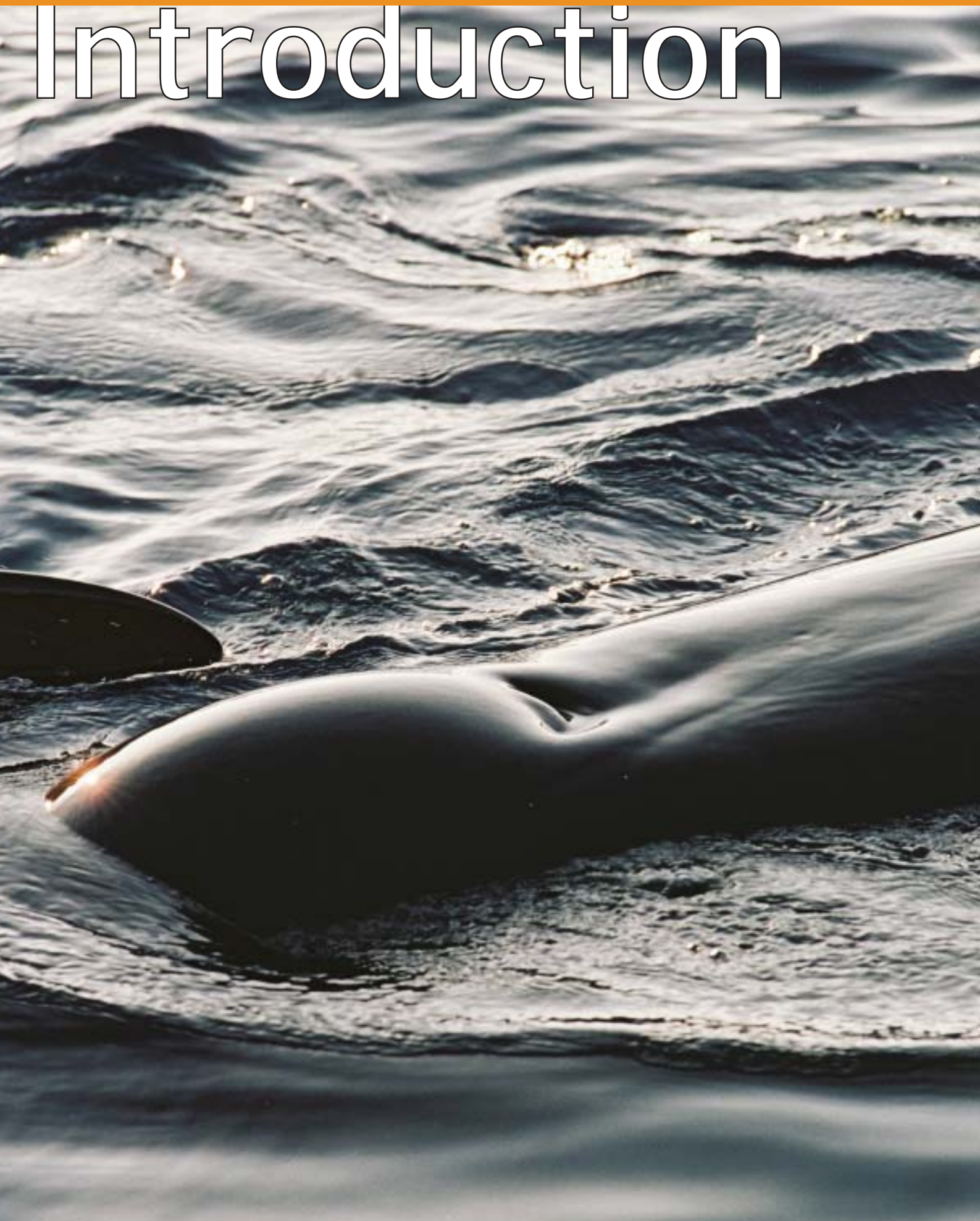
Pilot whale.