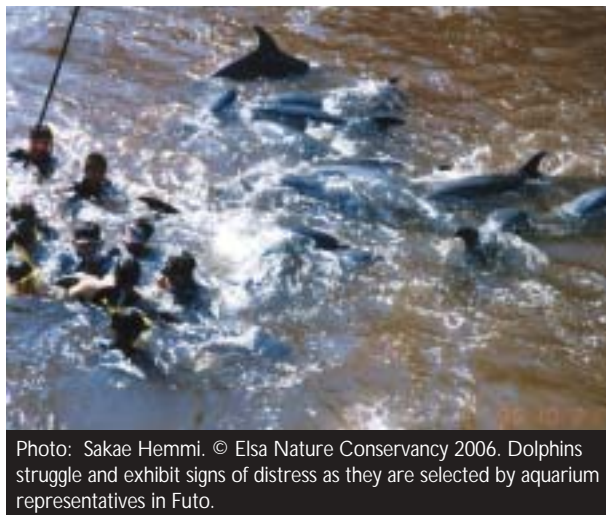
Dolphins struggle and exhibit signs of distress as they are selected by aquarium representatives in Futo.

Stress suffered during capture and the selection process is likely to compromise the survival of any dolphins released from the hunt. 140 Studies have shown that the capture of wild cetaceans, regardless of methodology, is liable to induce extreme levels of stress. 141 Chase and pursuit may result in stress-related mortality in cetaceans, since over-exertion may lead to muscular and cardiac tissue damage and possibly lead to shock, paralysis and death, or longer term morbidity. 142 However, no assessment has been made of the effects of the drive hunt on dolphins, including the long-term physiological effects on any survivors. Beyond this harmful individual impact, the disruption or damage to a captured animal's social group caused by its removal, while largely unknown and not well studied, may be substantial. 143