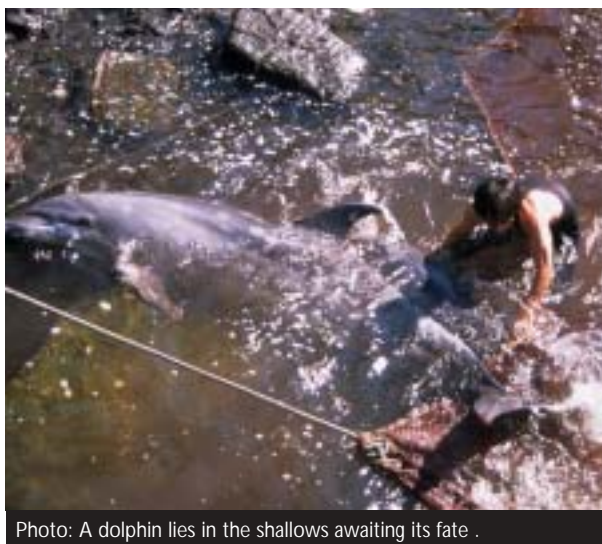
Photo: A dolphin lies in the shallows awaiting its fate .

The tiny island of Palau is situated in the Pacific Ocean to the north of Indonesia. In January 2002, Dolphin Bay, owned by Dolphins Pacific, opened in Palau. The facility, displaying 11 dolphins, offers interaction programmes such as swimming with dolphins and dolphin-assisted therapy. 128 Reports suggest the animals were exported from Japan and were captured in drive hunts. 129