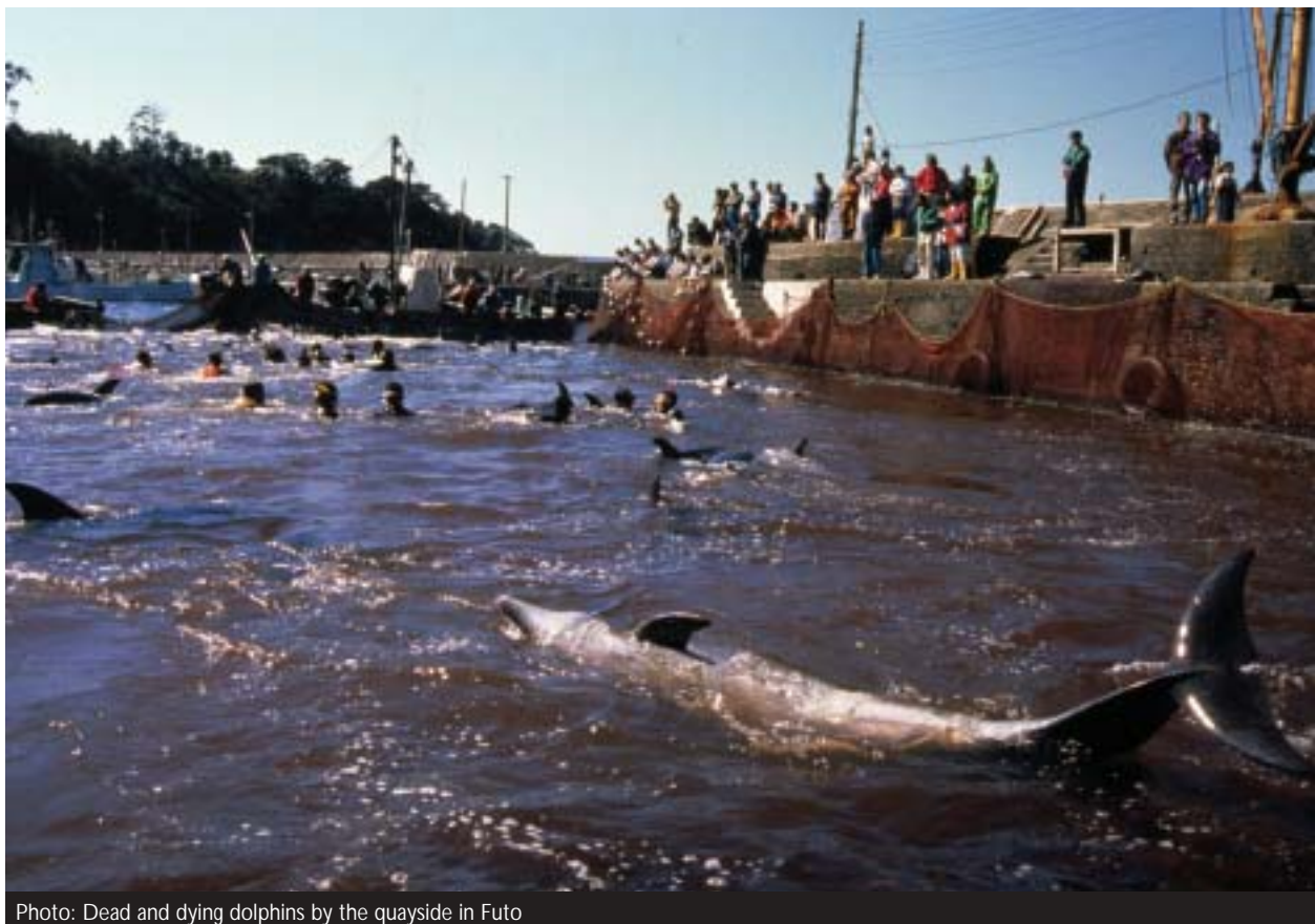
Photo: Dead and dying dolphins by the quayside in Futo

A female transferred from Futo in January 2005 was traced to Shinagawa Aquarium in Tokyo, in a tiny pool under a highway overpass, performing tricks for visitors. 158