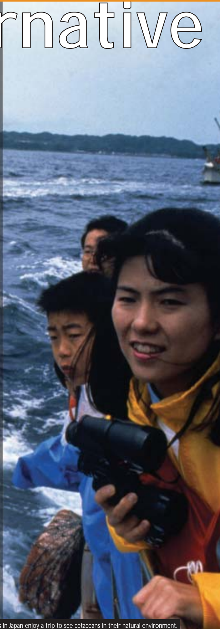
Whale-watchers in Japan enjoy a trip to see cetaceans in their natural environment.

The success of a viable alternative to the slaughter and sale of dolphins and other small cetaceans in Japanese coastal communities is proof that people can enjoy living cetaceans and make a living out of showing them to other people. While this alternative has yet to be fully realized in the towns conducting drive hunts, it is emerging in Futo, and elsewhere in Japan, and it is our hope that whale and dolphin watching will transform Japan's cetacean-killing communities into high-quality whale-watching destinations.