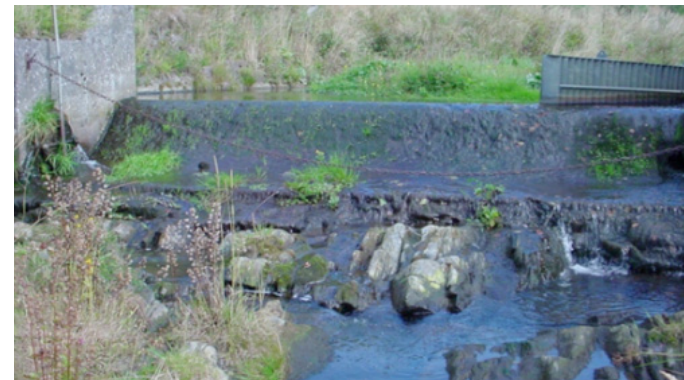
Above, Scottish Water Weir 2003; below, new fish pass 2013