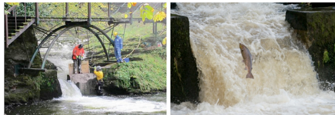
Specialist contractors removing obstacle and Salmon leaping at the Linn pot during winter 2013. And below, the Glen Keith Weir will be modified in 2014