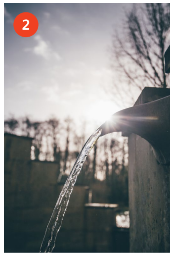
Scaladaqua Tonga* William Pye

The simple beauty of this water sculpture presents a stark warning to us all – etched onto the glass is the number of plant species threatened by extinction in the year 2000, the year the National Botanic Garden of Wales opened. According to the State of the World's Plant report in 2015, 1 in 5 plant species are now threatened with extinction.