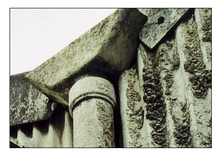
Moss and lichen growth on asbestos cement