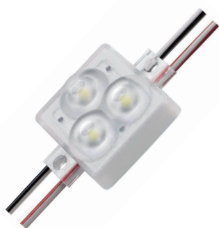
P560 PREMIUM MODULE

Product Code: P560-CW150lm (7500k Crystal White) Art. No. 28000335