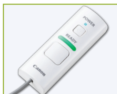
Optional Status Indicator