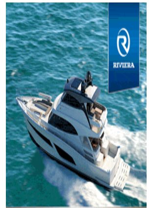
Acclaimed blue-water pedigree

Returning to a more authentic design space for passionate sailors who enjoy taking part in regattas such as the St Barths Bucket, Perfect 60 is expected to