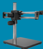
SB-BM2-DO * DUAL BOOM STAND