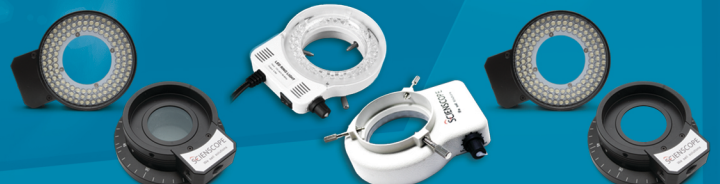
IL-LED-R3 POLARIZED LED RING LIGHT