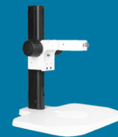
ST-76-LG ERGO TRACK STAND