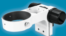
SB-AB-SZ MICROSCOPE FOCUS MOUNT

REQUIRED* ON ALL BOOM ARM AND ARTICULATING ARM STANDS