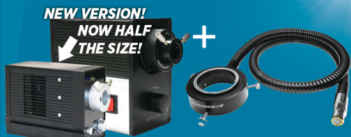
IL-FOI-L15 LED FIBER OPTIC ILLUMINATOR