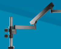
SB-CL2-FX * HEAVY DUTY ARTICULATING STAND