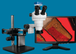
OPTICAL TEL:1(800)216-1800 & PRESS 2

CONTACT OUR PRODUCT DIVISIONS TO LEARN MORE ABOUT OUR LARGE VARIETY OF INSPECTION PRODUCTS