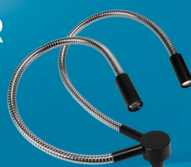
FC-DP-18 FIBER OPTIC DUAL PIPE LIGHT GUIDE