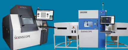
X-RAY & COMPONENT COUNTING TEL:1(800)216-1800 & PRESS 2