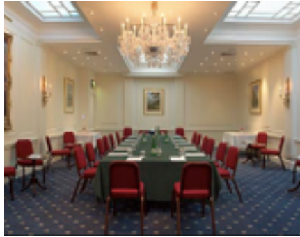
Meeting Room - Clive Room