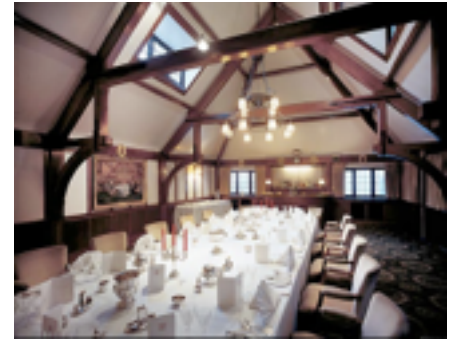
Lunch - Canadian Room