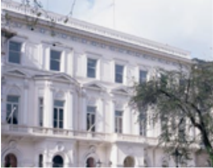
East India Club

Venue: EAST INDIA CLUB, 16 St. James's Square, London, SW1Y 4LH Tel: 020 7930 1000 10.00 am - 4.30 pm (Dress code: Smart casual, no jeans, jacket & tie for men)