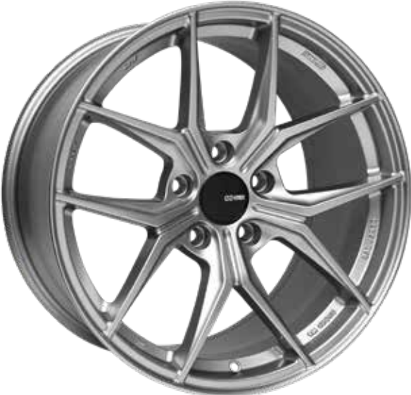
Storm Gray (Select Sizes)

Introducing Enkei's first ever Tuning Series Wheel available in 20". Enkei's Tuning Series wheels have taken the market by storm thanks to their high-strength MAT construction and competitive pricing. Due to increasing customer demand for a lightweight 20" wheel in this series, we are proud to introduce the all-new TSR-X. Available in Gloss Black, Bronze, and Storm Grey, the TSR-X is the perfect option for those looking to go big while keeping weight down on their late model sports coupes, sedans, and even crossovers.