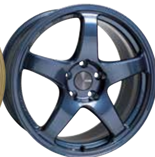
Blue (Special Order)