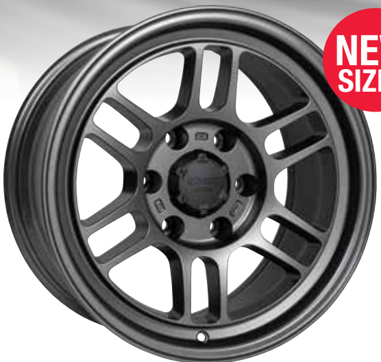
17x9 w/cap Matte Dark Gunmetal