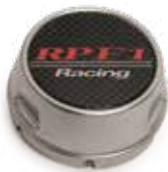
Optional cap for 15x8, 16, 17, and 18 inch RPF1 (A379-0000SP)