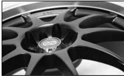
Matte Black with Machined Lip