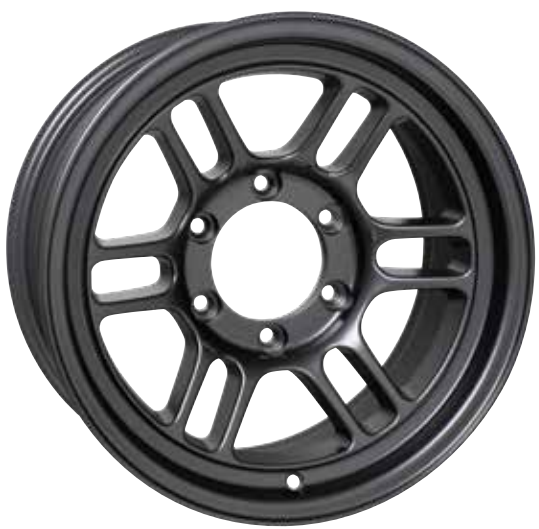
Matte Dark Gunmetal