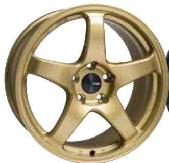
Gold (Special Order)