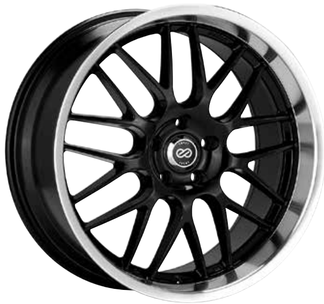
Black with Machined Lip