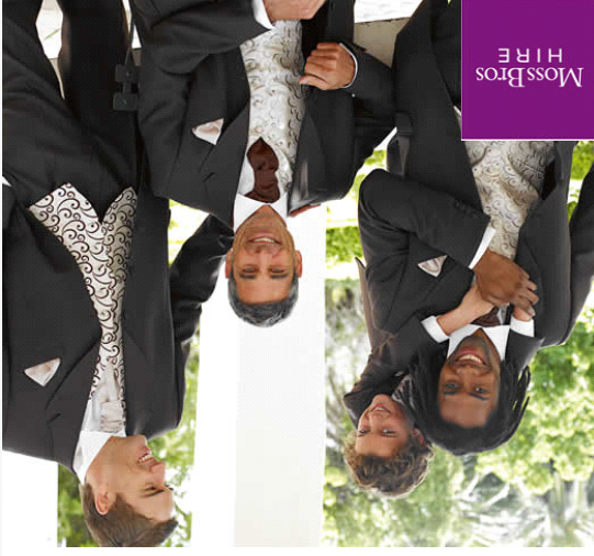
Moss Bros HIRE