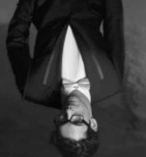
(above) Formal Dresswear from our contemporary range by DANIEL HECHTER