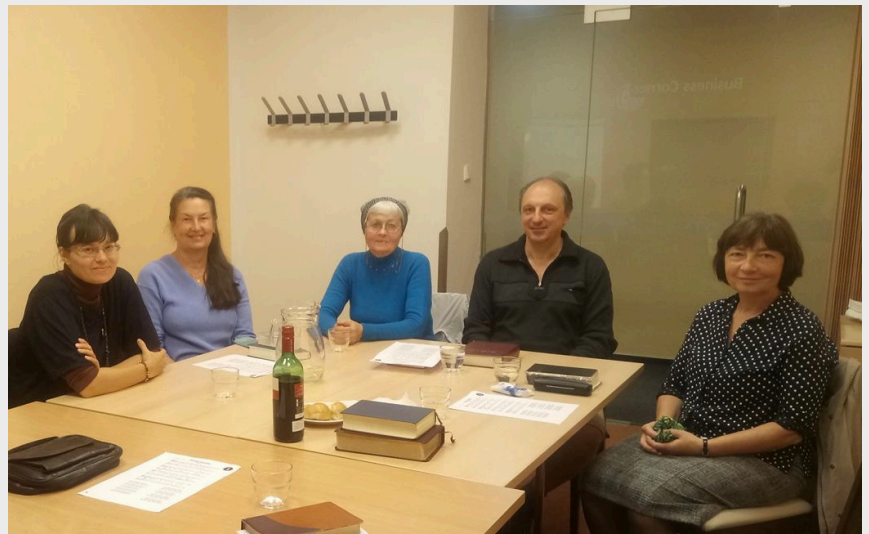
Brothers and sisters in Prague receive a monthly CIL exhortation translated from English to Czech