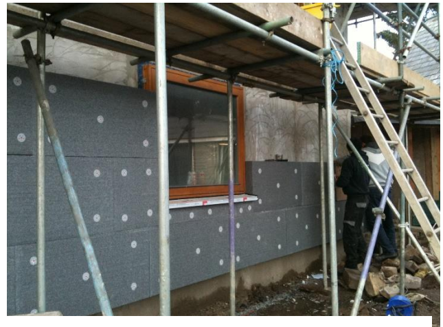
Wall insulation being fitted to an old property (Not all retrofits are as drastic as this!)

Since about 70% of housing in Wales is owner-occupied, the responsibility to make these improvements rests with many of us individually but it's not easy. What needs to be done to my house? Where can I get unbiased advice? What will it cost? Where do I begin?