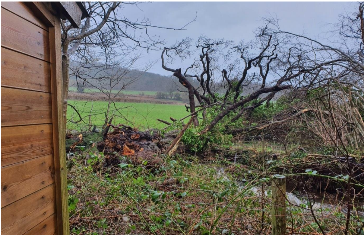
Fallen tree near Cwm Gu turbine house