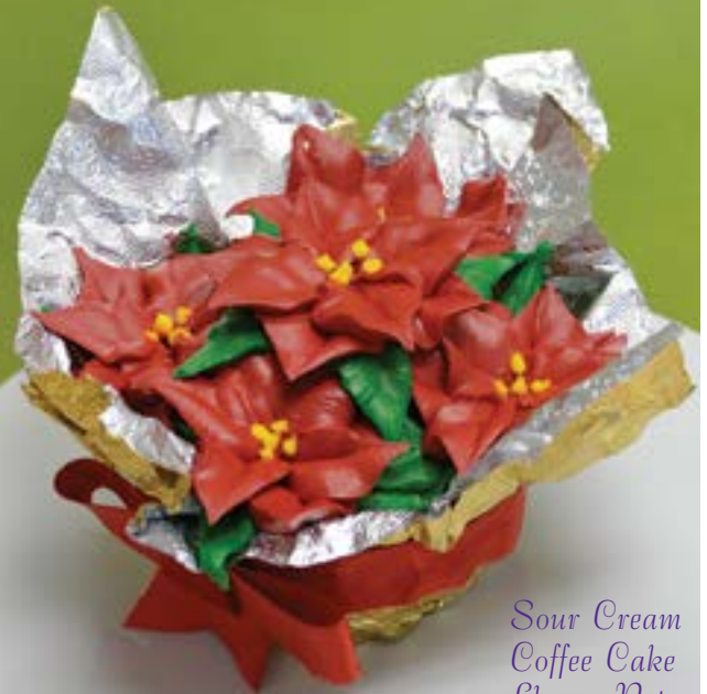
Sour Cream Coffee Cake Flower Pot

Make a lasting impression on your guests this year