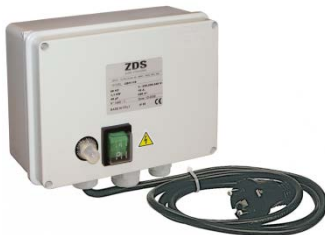
Control-Box – Range of single and three phase control boxes. Bespoke configurations such as time on / pressure off available on request.