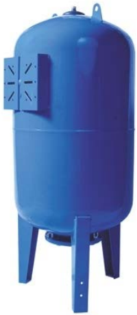
Pressure vessels, pressure switches and pressure gauges

Carter Pumps have been drilling boreholes and installing pumping equipment since we started in 1984. With good levels of stock and an experienced team you can be sure we are in a position to help.