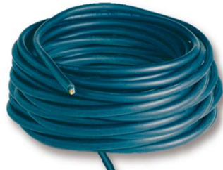
Single and three phase drop cable usually available from stock.