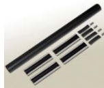
Heat shrink cable connection kits