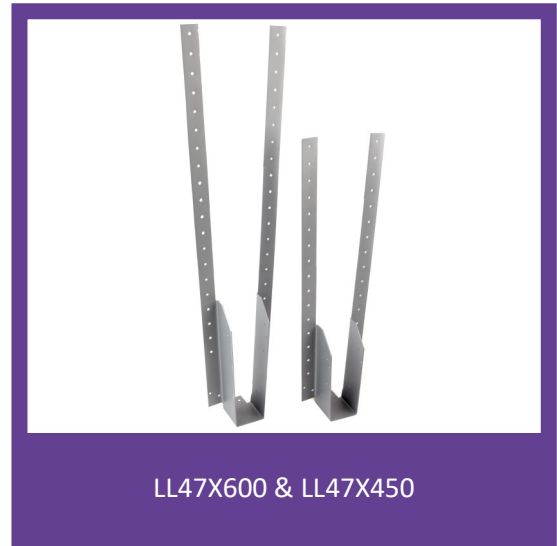
LL47X600 & LL47X450