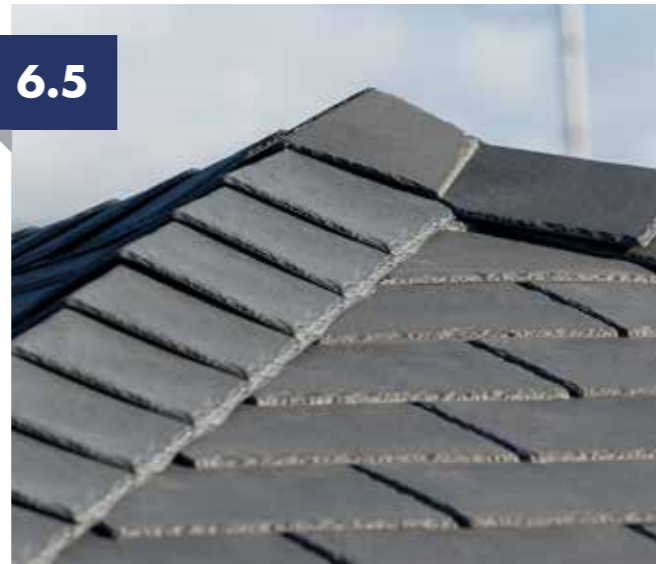
Affix ridge tiles using 2 x 30mm stainless steel screws.