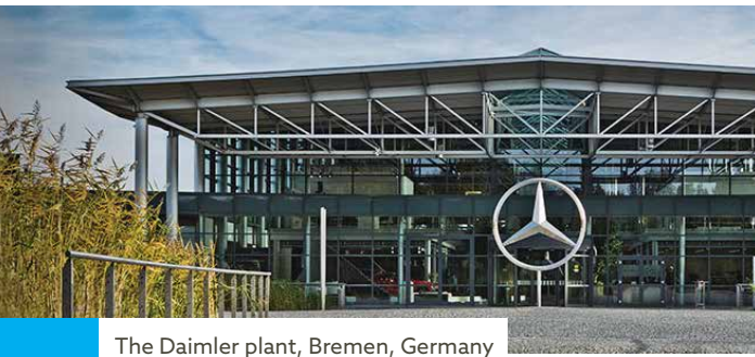
The Daimler plant, Bremen, Germany