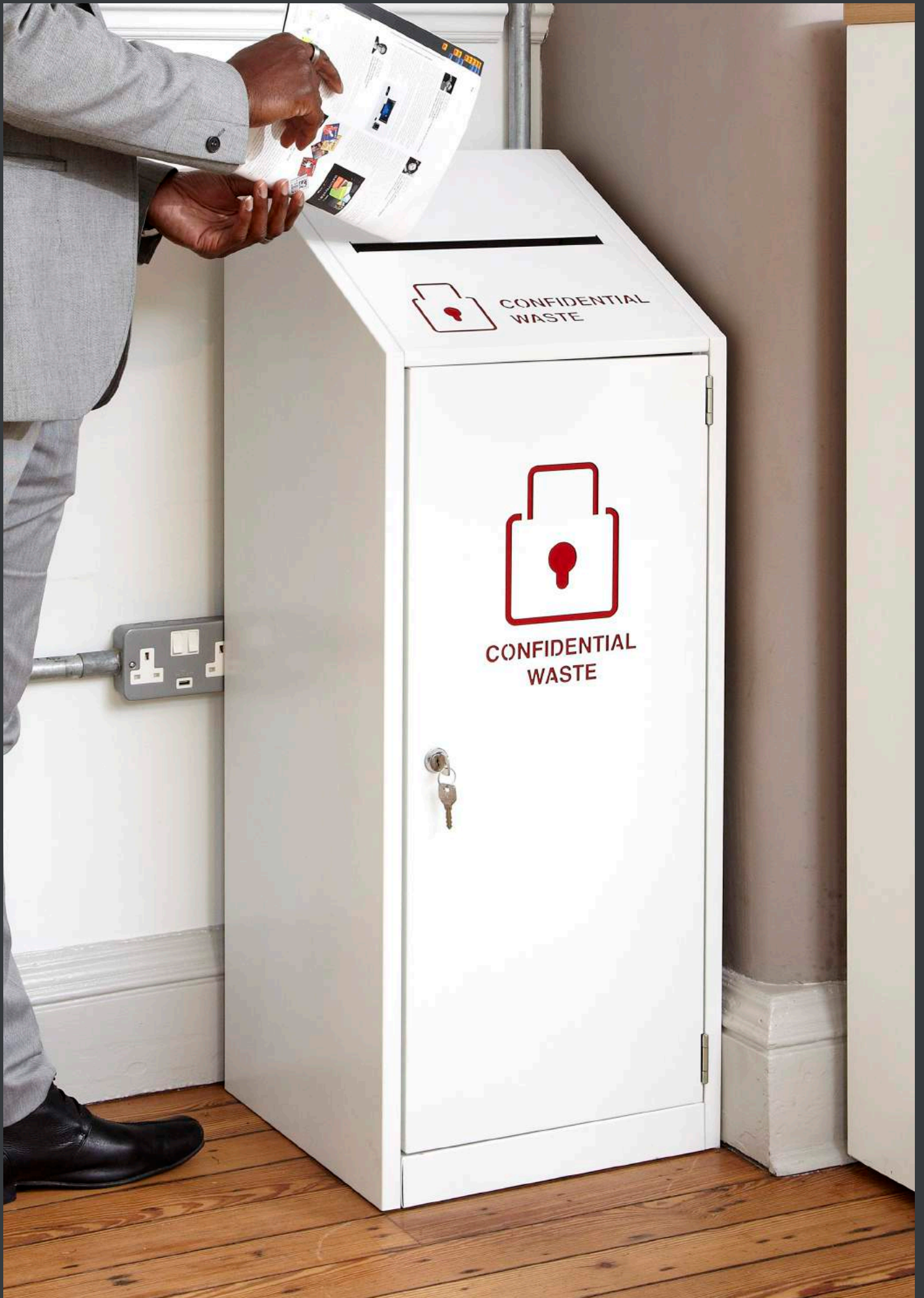
10 Left Image: Confidential recycling bin. Right Image: Laser cut designs in Flexiform's Ferro clear coat lacquer.