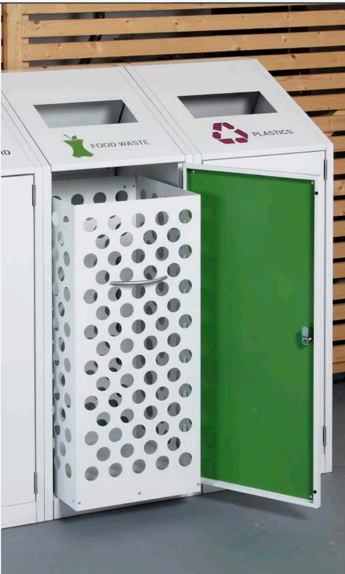
Food waste Recycling Bin with removable perforated bin.