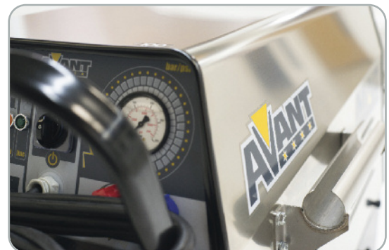
STAINLESS STEEL LANCE HOLDER AVANT/ACC002