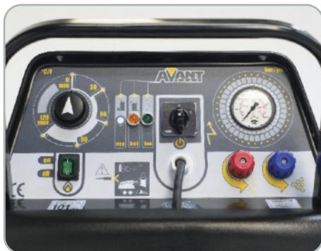
EASY TO USE CONTROLS