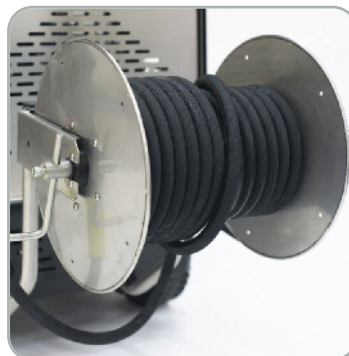
20m STAINLESS STEEL HOSE REEL AVANT/ACC001