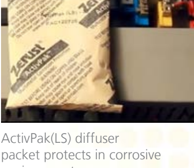
packet protects in corrosive environments.