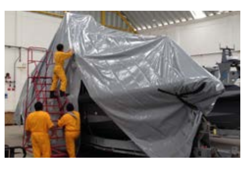
Zerust Outdoor Shrink VCI Film protects large equipment for operational readiness.