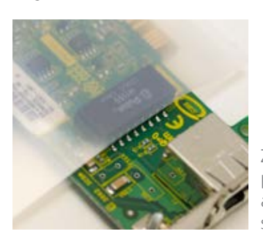
Zerust Anti-Tarnish Film protects metals from rust and tarnish with acid-gas scavenging technology.