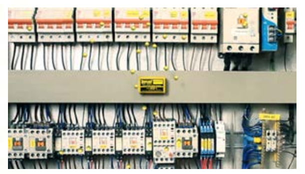
Zerust corrosion inhibitor diffusers go to work in minutes to saturate enclosures with protective VCI molecules.

VCI molecules inhibit corrosion by preventing moisture and environmental elements from reacting with the metal surface. Since VCI molecules are transported through the air, they must be trapped around the metal surface using a poly bag or other enclosure. Later, when the enclosure or package is opened, the Zerust corrosion inhibiting layer dissipates, leaving clean, dry and residue-free metals.