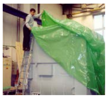
Zerust Multimetal Film protects an oversized piece of electronic equipment for up to five years.

Protect exterior surfaces of parts and equipment with Zerust vapor corrosion inhibitor packaging materials. Wrap and enclose objects of any size to protect them from humidity, dirt and contaminants. Zerust VCI Film packaging materials ensure that parts are protected in storage and in shipping from contact deterioration and a degraded appearance.