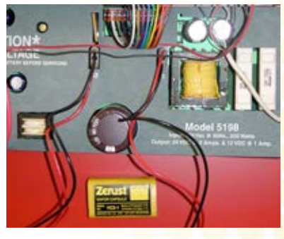
VC2-1 Vapor Capsule protects multiple metal types.