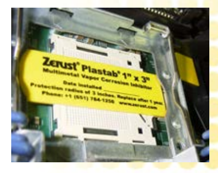
Plastabs fit and protect small spaces.

Plastabs are made of light, rigid plastic and diffuse corrosion inhibitors. Their small and thin shape makes Plastabs perfect for protecting critical surfaces within narrow or hard-to-reach areas of enclosures. Use them to prevent corrosion in small spaces or as added protection to enclosures or packaged items.