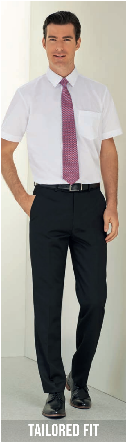
APOLLO Tailored Fit Trouser Black Flat front, 2 side pockets, 1 rear pocket. Vesta Shirt - White