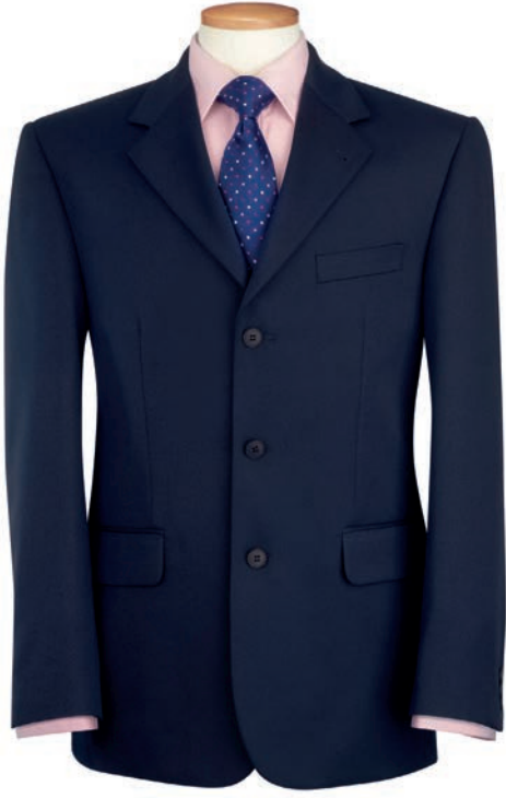
Centre back length at size 40R = 78cm

Codes & Colours: 5981A Navy 5981C Charcoal 5981D Black