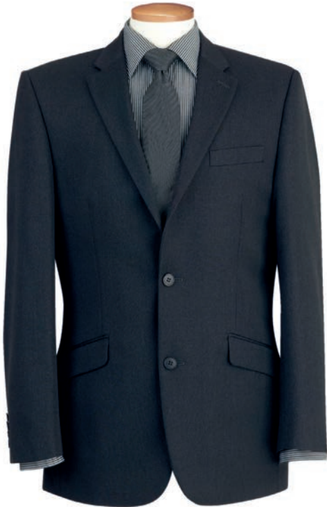
Centre back length at size 40R = 77cm

Codes & Colours: 3124A Navy 3124C Charcoal 3124D Black