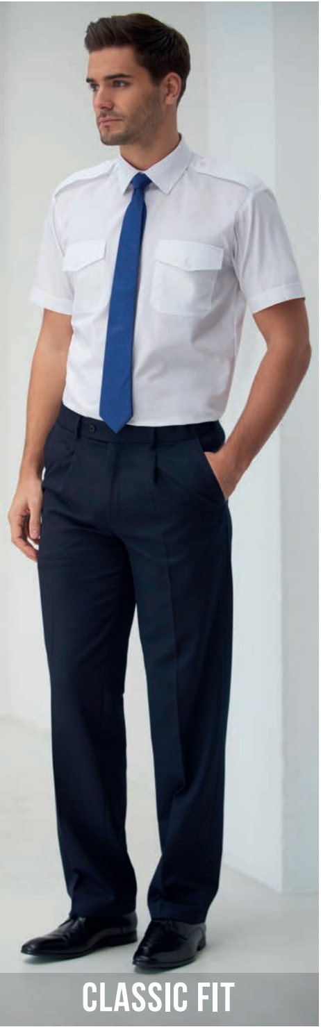
ATLAS Classic Fit Trouser Navy Single pleat, with waistease function, 2 side pockets, 1 rear pocket Orion Shirt - White