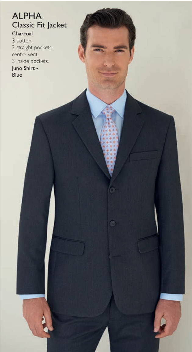
ALPHA Classic Fit Jacket Charcoal 3 button, 2 straight pockets, centre vent, 3 inside pockets. Juno Shirt - Blue