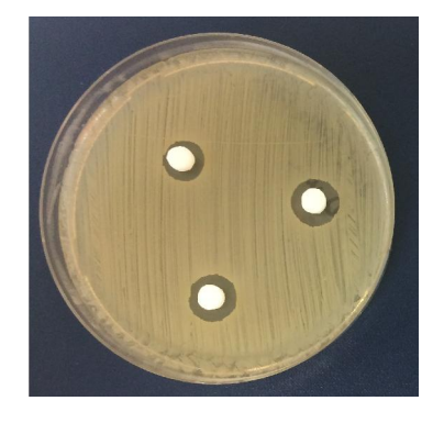
Figure 2. Silicones doped with 10% Pertinax provide zones of inhibition on lawns of E. coli .