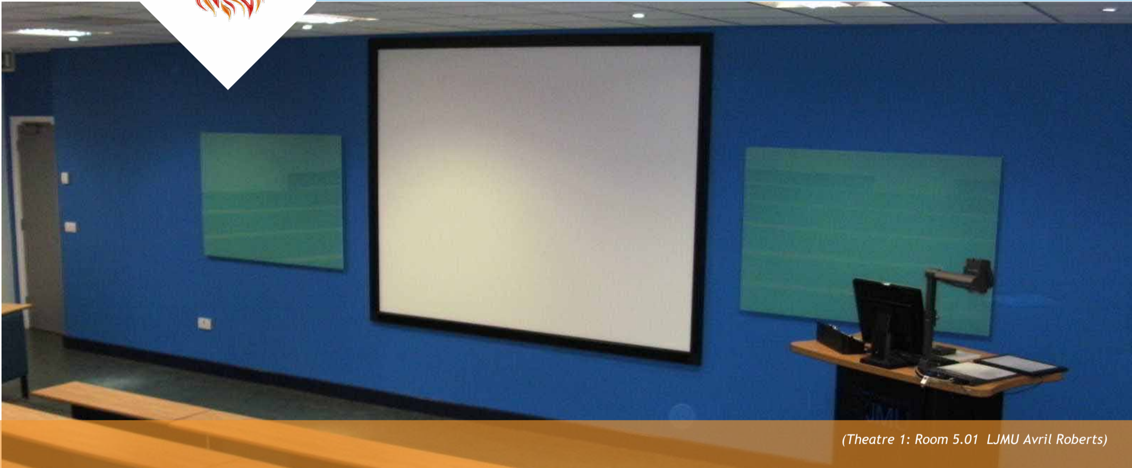
(Theatre 1: Room 5.01 LJMU Avril Roberts)