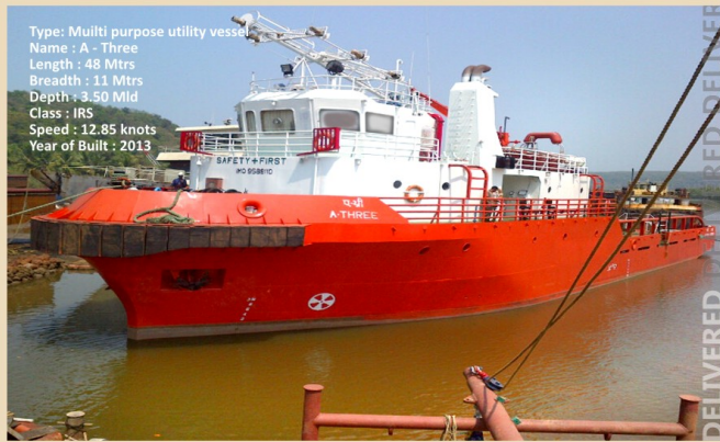
Type: Multi purpose utility vessel Name : A - Three Length : 48 Mtrs Breadth : 11 Mtrs Depth : 3.50 Mld Class : IRS Speed : 12.85 knots Year of Built : 2013