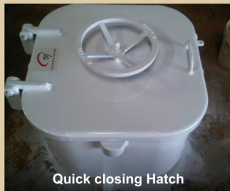
Quick closing Hatch