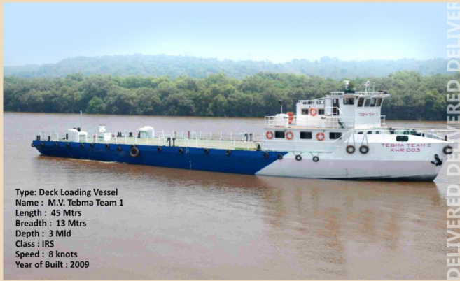
Type: Deck Loading Vessel Name : M.V. Tebma Team 1 Length : 45 Mtrs Breadth : 13 Mtrs Depth : 3 Mld Class : IRS Speed : 8 knots Year of Built : 2009