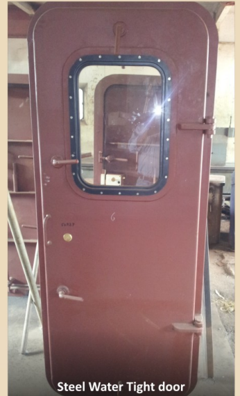
Steel Water Tight door