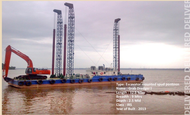
Type: Excavator mounted spud pontoon Name : Grab Dredger 1 Length : 32.5 Mtrs Breadth : 9 Mtrs Depth : 2.5 Mld Class : IRS Year of Built : 2013