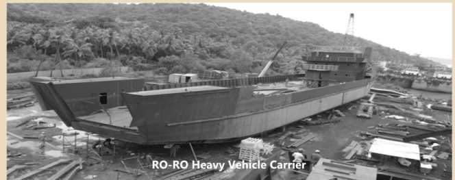
RO-RO Heavy Vehicle Carrier