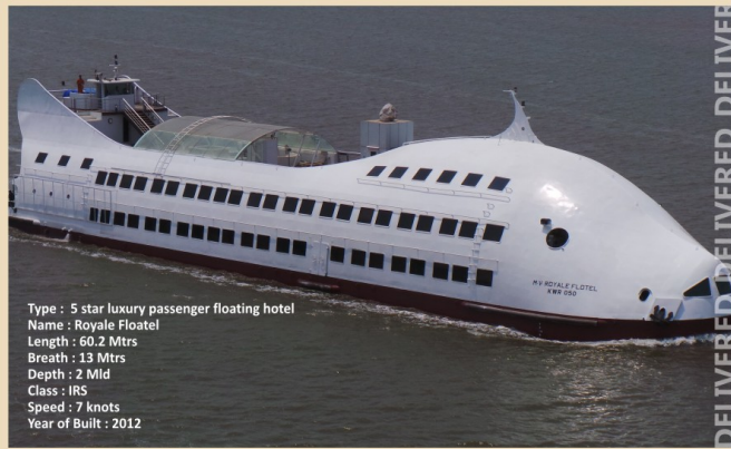
Type : 5 star luxury passenger floating hotel Name : Royale Floatel Length : 60.2 Mtrs Breadth : 13 Mtrs Depth : 2 Mld Class : IRS Speed : 7 knots Year of Built : 2012