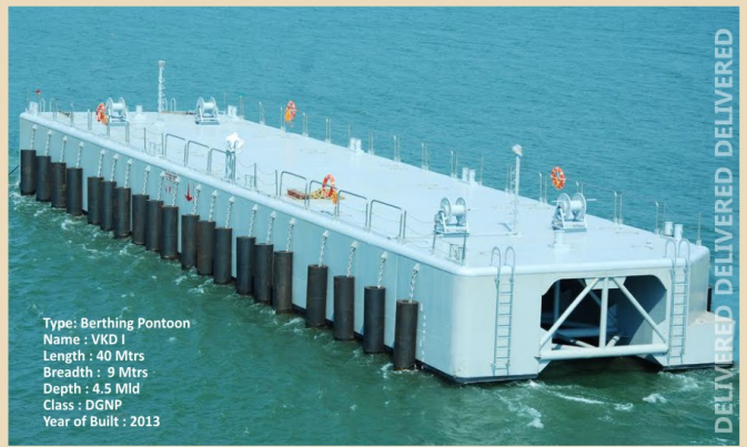
Type: Berthing Pontoon Name : VKD 1 Length : 40 Mtrs Breadth : 9 Mtrs Depth : 4.5 Mld Class : DGNP Year of Built : 2013