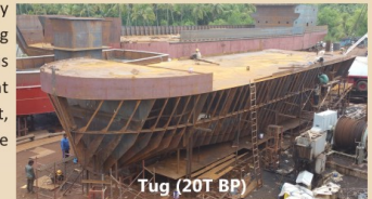
Tug (20T BP)

The shipyard has 3 pontoons, installed with 50T crane, gen sets, mobile 400watt lighting towers and other necessary equipment to assist in quick commissioning of ships after launching, and attend to various scopes of repair and refit jobs. Relevant facilities for carrying out inclining experiment, load trials etc and other tests on the vessel are available with shipyard.