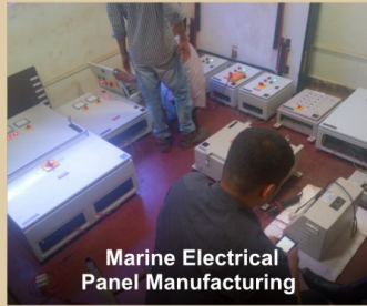
Marine Electrical Panel Manufacturing