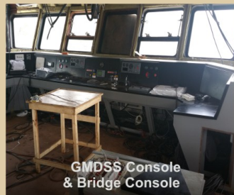
GMDSS Console & Bridge Console