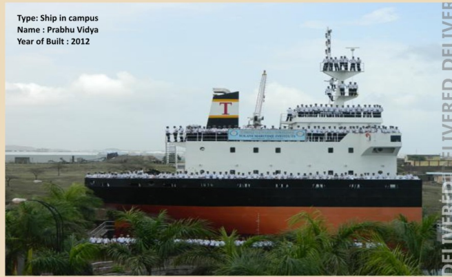
Type: Ship in campus Name : Prabhu Vidya Year of Built : 2012