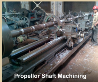
Propellor Shaft Machining

We Have the infrastructure and skilled team to manufacture critical ship components under Class certification .This enables the shipyard to have a complete control on quality / workmanship standards of ancillary products and reducing the delivery period of ship. We manufacture the following: