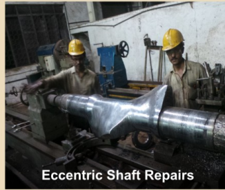
Eccentric Shaft Repairs