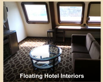
Floating Hotel Interiors