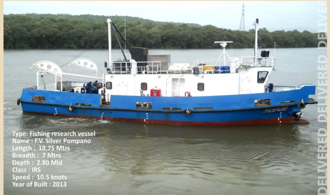
Type: Fishing research vessel Name : F.V. Silver Pompano Length : 19.75 Mtrs Breadth : 7 Mtrs Depth : 2.80 Mld Class : IRS Speed : 10.5 knots Year of Built : 2013