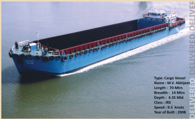
Type: Cargo Vessel Name : M.V. Abhijeet Length : 70 Mtrs Breadth : 14 Mtrs Depth : 4.35 Mld Class : IRS Speed : 9.5 knots Year of Built : 2008