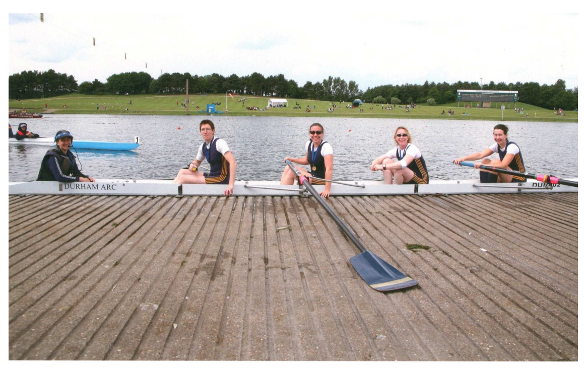
Womens Masters Champions