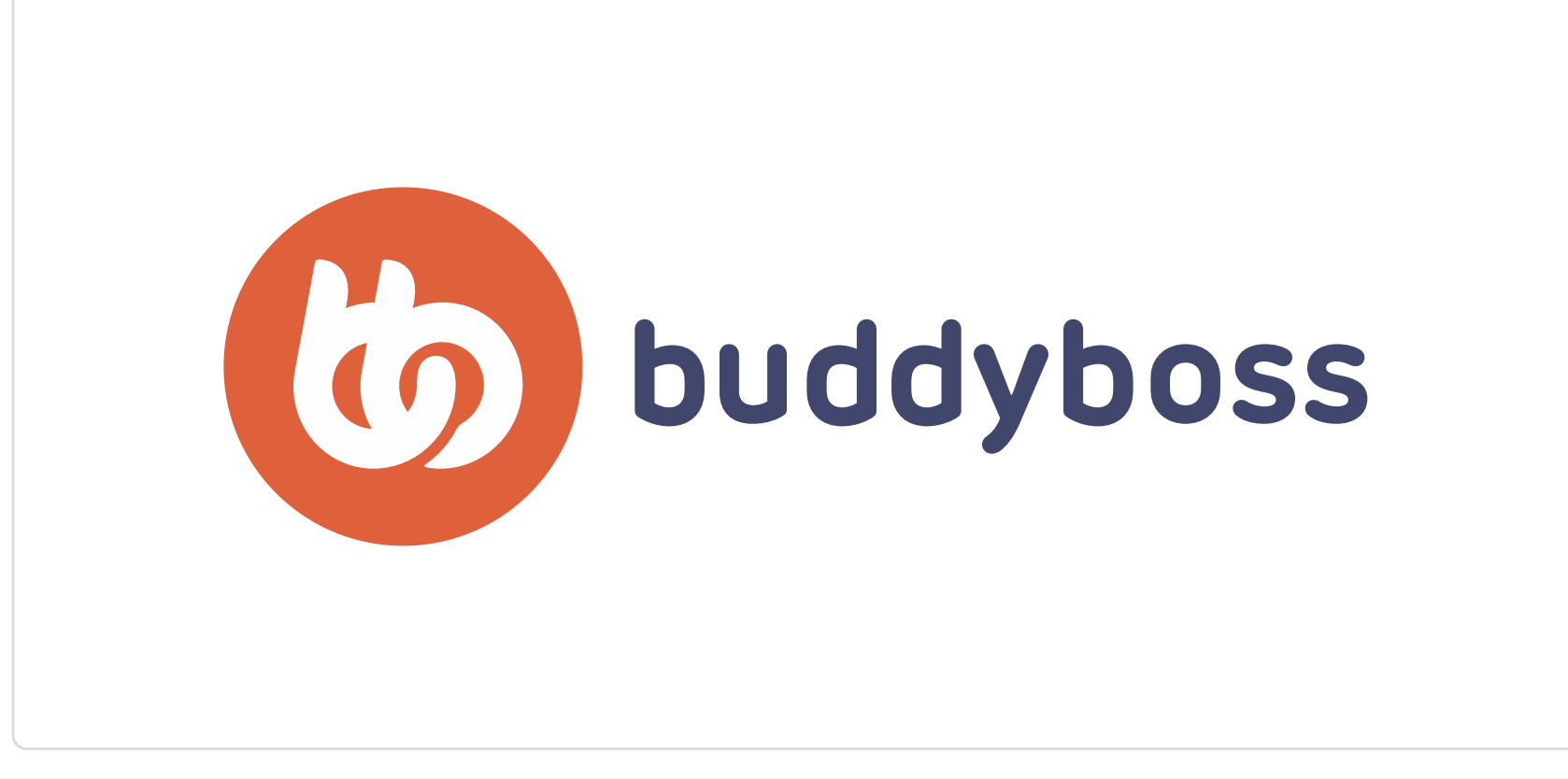
Primary Orange Use the Orange version of the logo on white backgrounds.

The BuddyBoss logo is either Orange or white and always contrasts with the background. For optimum reproduction quality in all media