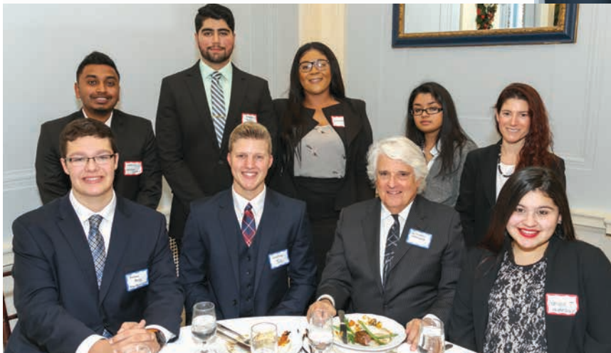
Vaughn College student table sponsored by Airbus Americas