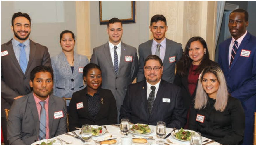
Students and faculty from City of New York University (CUNY)