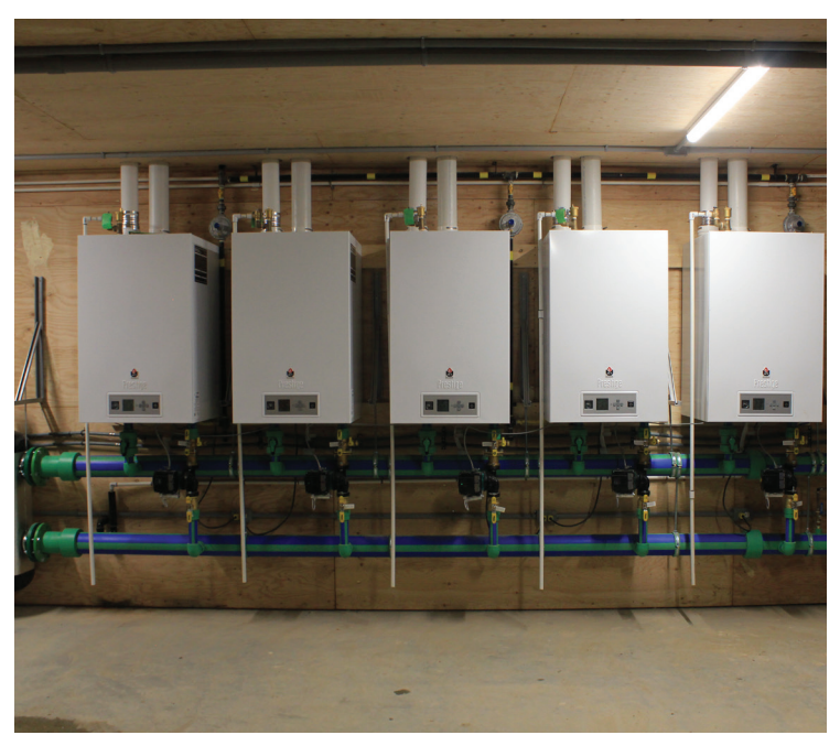
Aquatherm Blue Pipe moves 1.2 million BTUs generated by five 399,000 Btu condensing boilers at this pig barn.

"I've found that most contractors in North America don't really set up to clean new systems