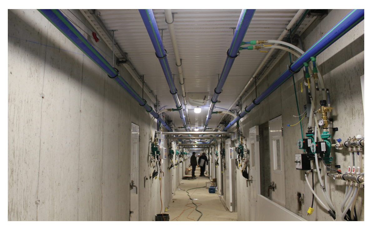
Aquatherm pipe during construction of this pig barn. The pipe's light weight and ease of handling made it easy to hang, and it now carries heated water to the four zones of this barn.

"I found it interesting how many people took a liking to this project," he said. "To me, designing like this with Aquatherm has just become kind of standard. So we really found it extraordinary that we had people from all over the world commenting."