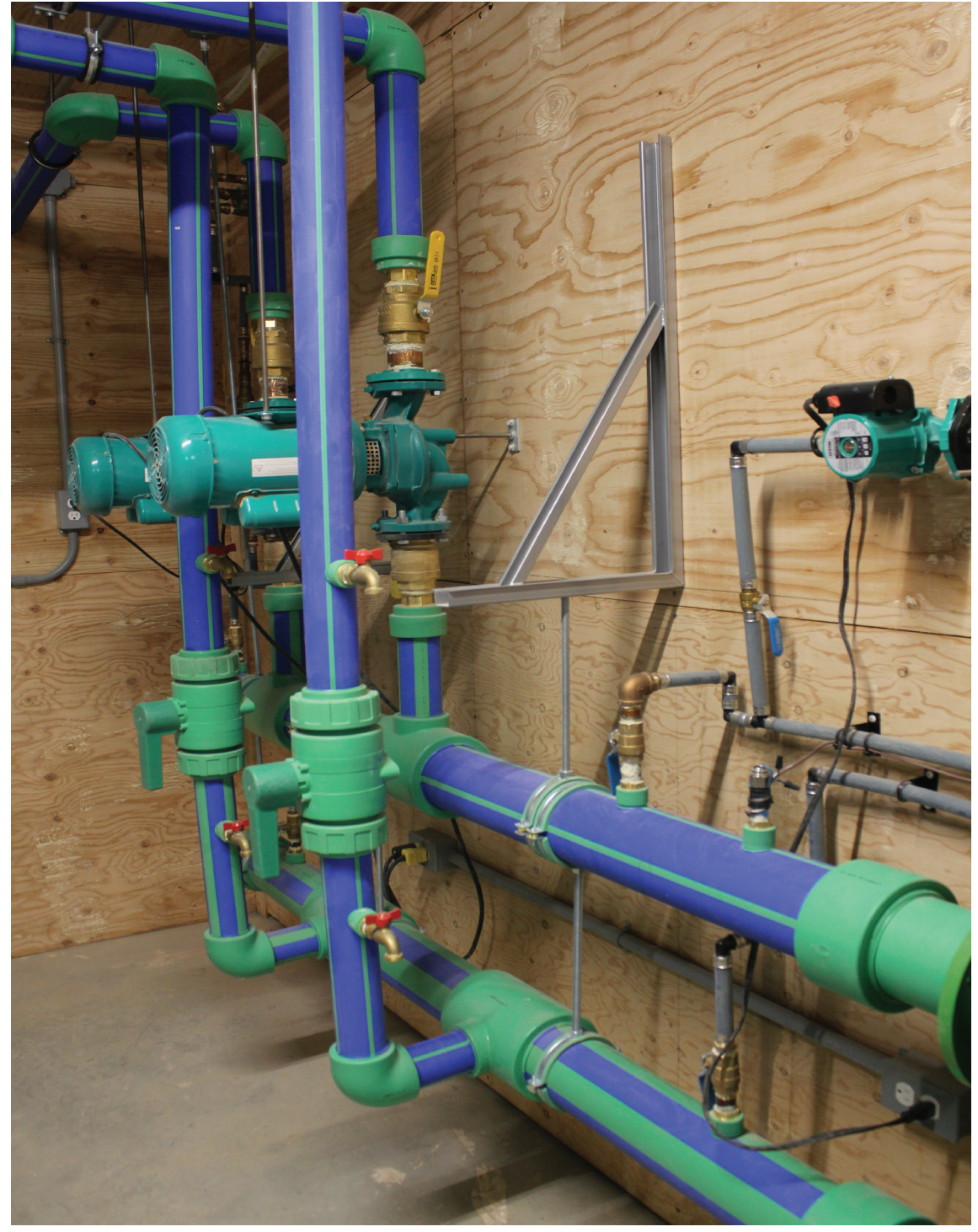
The contractor on this project was impressed that Aquatherm pipe doesn't radiate heat like black pipe does.

of 2017. The process went smoothly, with Ritmo fusion tools and support from Hydronic Solutions.