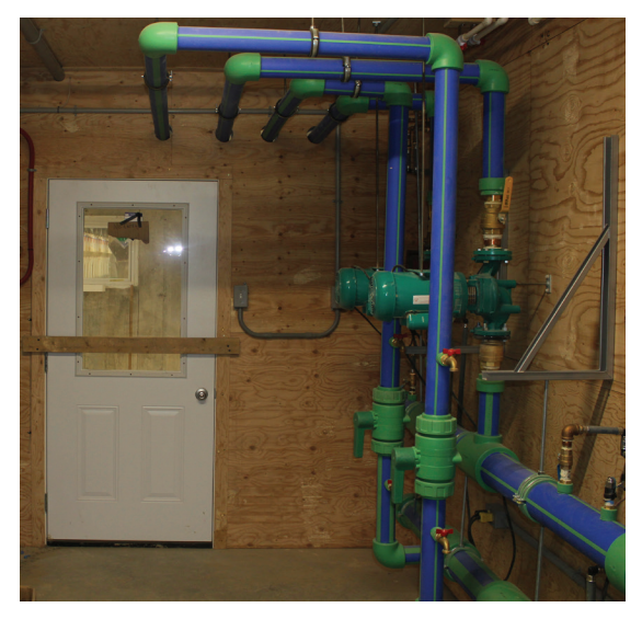
Aquatherm pipe feeds four zones in this 64,000 sq ft pig