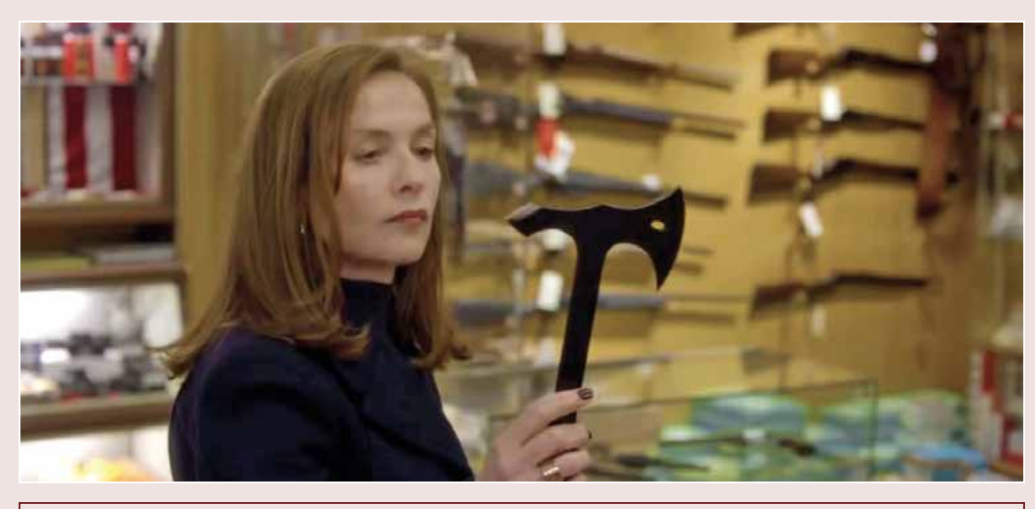
Winchester Film Society General & Membership Enquiries

So please join us at Winchester Science Centre and Planetarium on a Tuesday night. For the whole season or just a single film, whichever you choose, a warm welcome awaits.