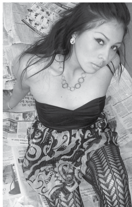
Bay Area Vixen photoshoot, 2007

It's hard to say what sidetracked her. It's hard to say what didn't. For one thing, Gutierrez says she couldn't handle the responsibility of off-campus lunch periods.