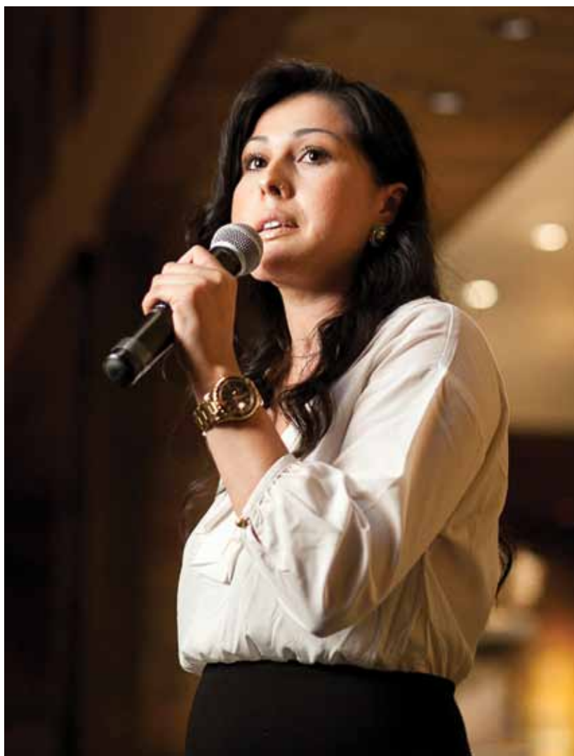
Speaking at Youth ALIVE!'s 20th Anniversary Celebration, 2011

She had had to cut away her prized long hair after the hospital. Unwashed, laced with blood and pressed against a hospital pillow for a