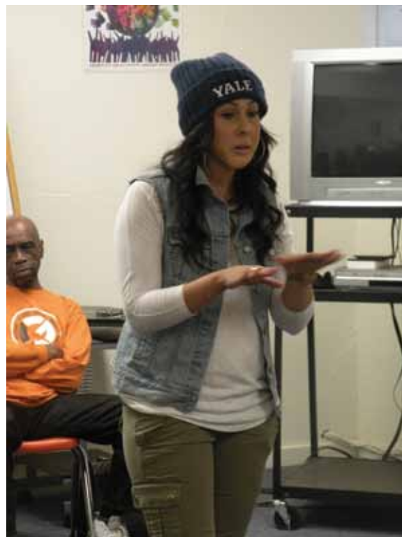
Speaking to an Oakland youth group

It was time to begin her new life with the old mask gone and the new one uncertainly in place, time to confront her loss in a whole new way.