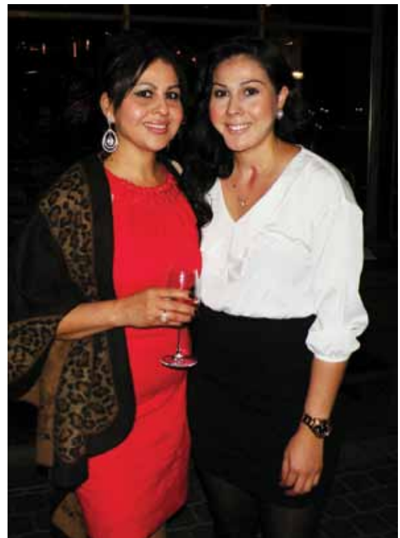
Mother and daughter, November 2011