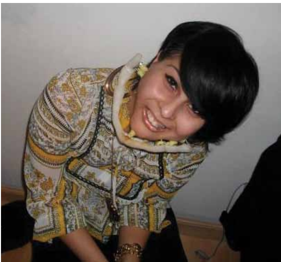
New Years Eve 2009, brace holding jaw in place