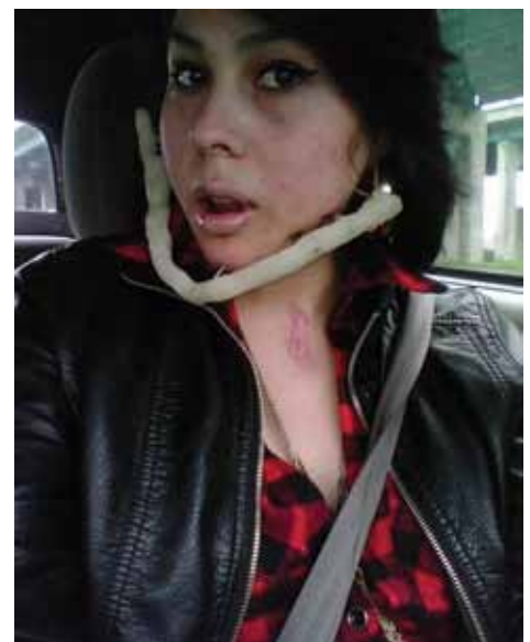
Self-portrait, mid 2009

"It was just so mysterious and scary, even in the daytime I couldn't be left alone. When my mom was cooking I'd be in the kitchen trying to stay awake, because I didn't want to go to sleep, and I would close my eyes and nod my head and it would just be a nightmare."