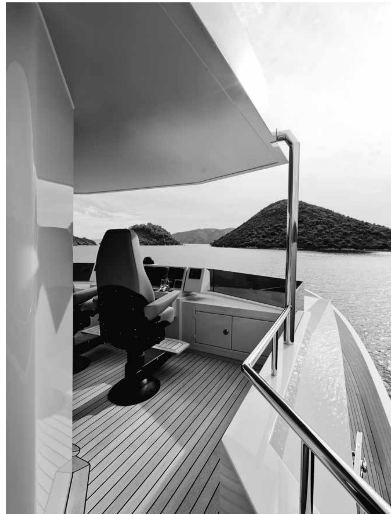
The upper deck features a full flybridge helm station with three seats

The boat deck is a multi-faceted playspace and wet area, as useful during the day in the sun as it is for alfresco dining