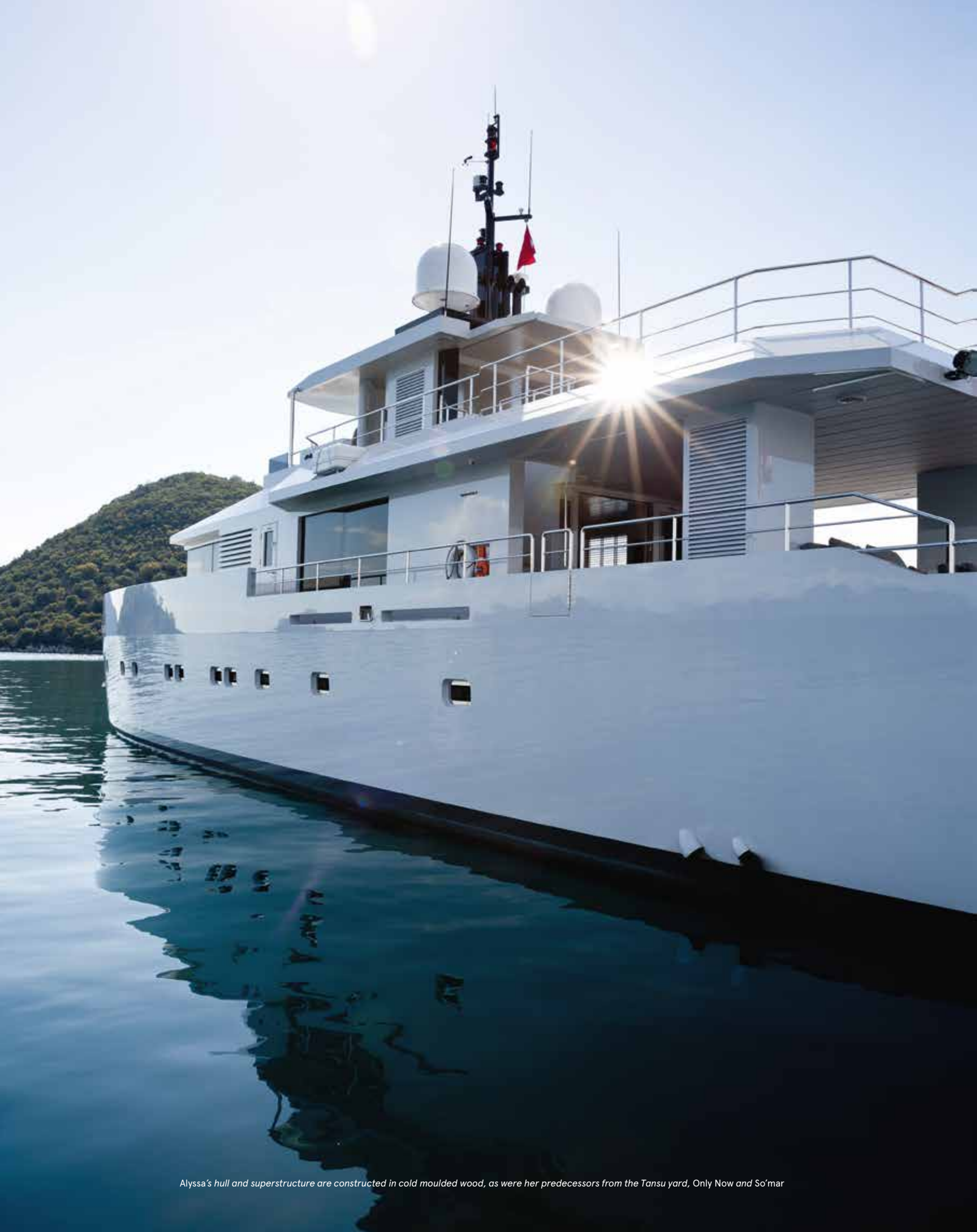
Alyssa's hull and superstructure are constructed in cold moulded wood, as were her predecessors from the Tansu yard, Only Now and So'mar