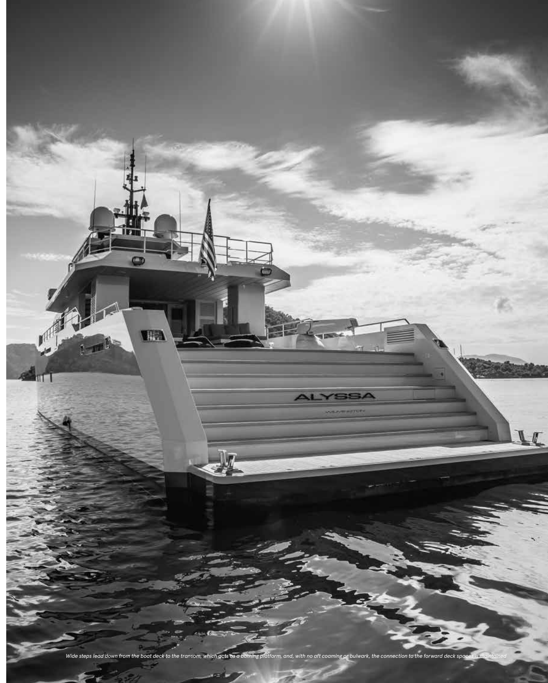
Wide steps lead down from the boat deck to the transom, which acts as a bathing platform, and, with no aft coaming or bulwark, the connection to the forward deck spaces is maintained