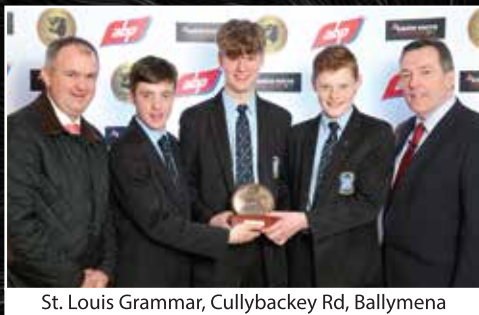
St. Louis Grammar, Cullybackey Rd, Ballymena