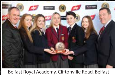
Belfast Royal Academy, Cliftonville Road, Belfast

To register, email your interest and details of the school to info@angusproducergroup.co.uk