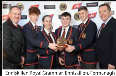
Enniskillen Royal Grammar, Enniskillen, Fermanagh