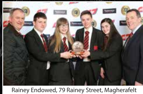
Rainey Endowed, 79 Rainey Street, Magherafelt