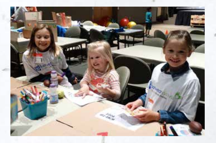
Bring Your Child to Work day ends with a box decorating event benefiting the popular Baby Bundles program to support Two Ten.

Wolverine Worldwide has been a strong supporter of Two Ten for many years. Our associates participate in both fundraising activities as well as holding leadership positions on the Two Ten board.