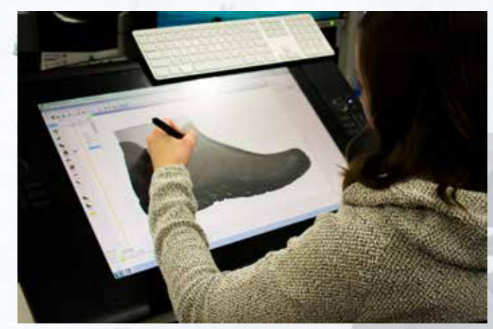
Digital design streamlines the product lifecycle process.