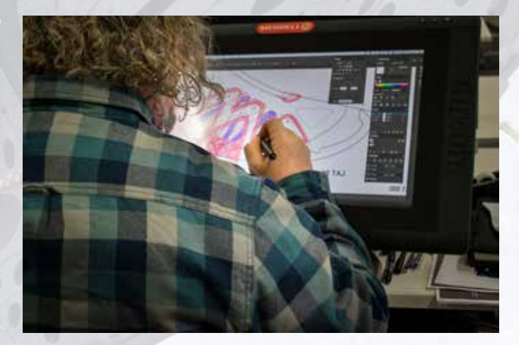
This early stage of color and texture design will enable 3D printing of a new prototype.