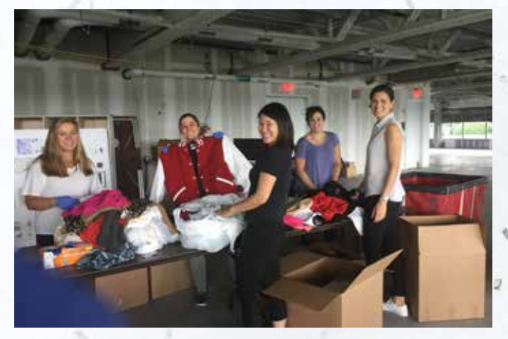
Wolverine associates partner with Salvation Army and Cradles to Crayons in spring clothing drive.