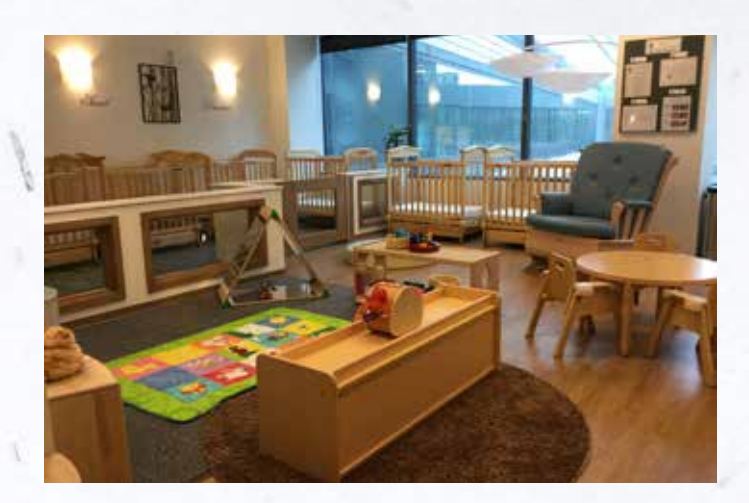
Waltham child care center

We recognize how important beginnings are in each child's development, and to each family. Our Waltham, Massachusetts facility offers on-site child care to our employees.