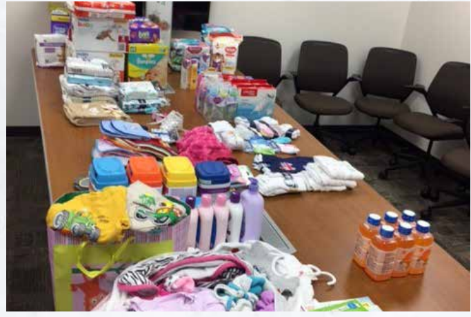
Richmond Baby Bundles donations.