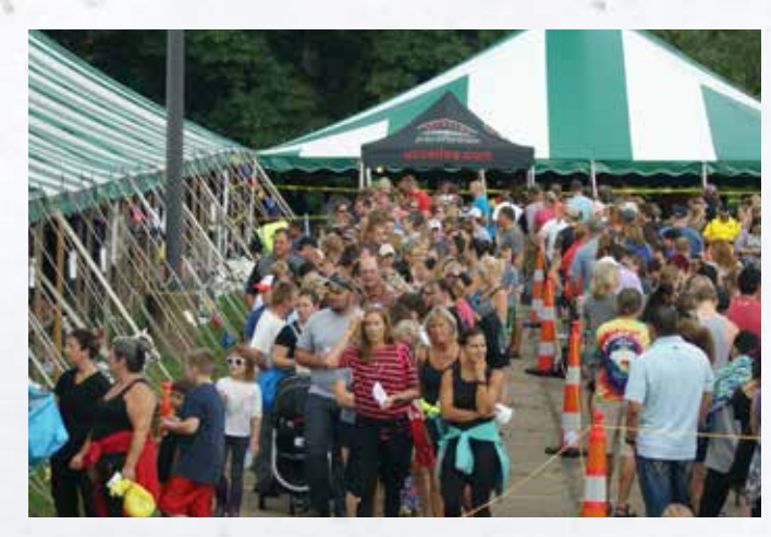
Super Mega Tent Sale fundraises at two North American locations.