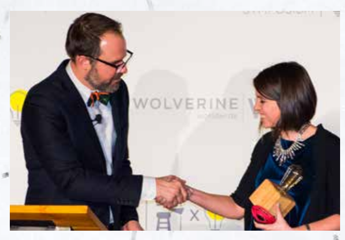
Inaugural Inny Award ceremony to recognize innovative work across the enterprise.