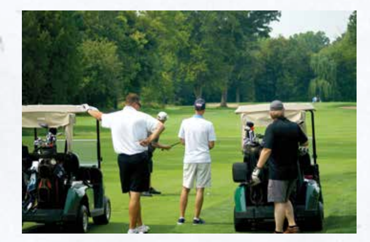
The 2017 Rockford golf outing was a huge success for United Way.