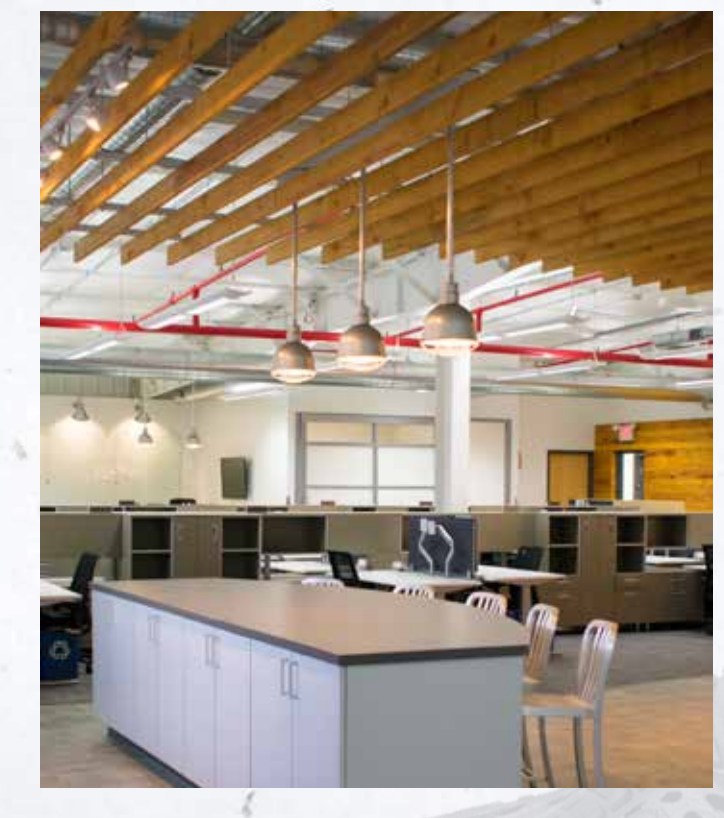
Inside the Lighthouse.

The Lighthouse project is part of the Company's innovation agenda, designed to accelerate the Company's innovation revolution and to serve as a catalyst to bring compelling products and stories to the global marketplace. The Lighthouse enables our teams to better understand our consumer, the competition, global marketplace, and future innovations that will ultimately drive growth for the Company.