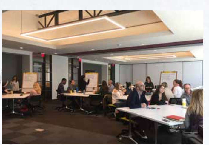
Team members participate in training session in the Boston office.