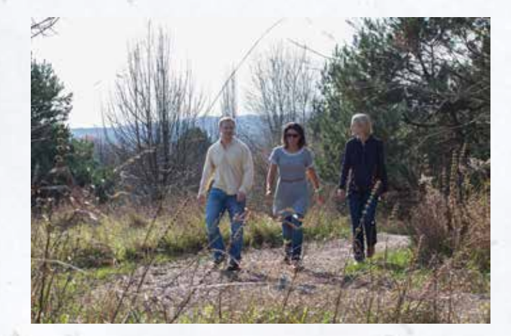
Hiking trails wind through fields, forest and wetlands on the Rockford campus.