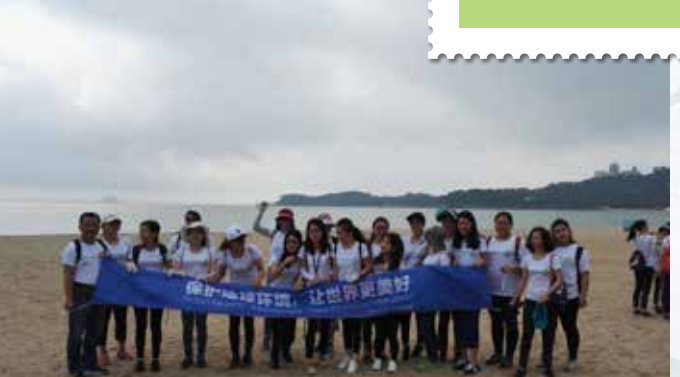
The Wolverine China team's beach clean up.