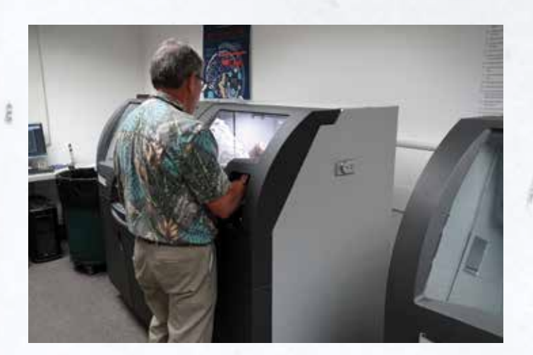
3D printer training facilitates acurate prototypes.