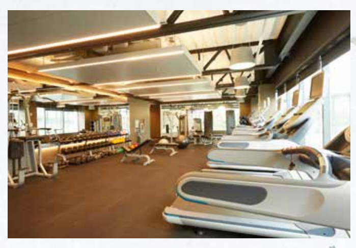
Waltham fitness facility