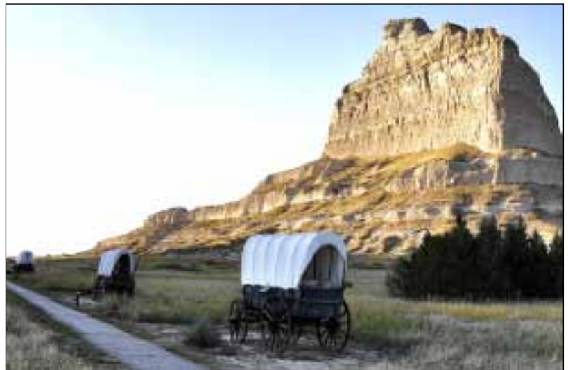
Scotts Bluff National Monument.

Meet in the parking lot of the NHTIC at 8 a.m.