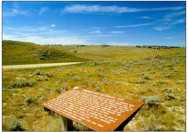
Emigrant Gap.

Meet in the parking lot of the NHTIC at 8 a.m.