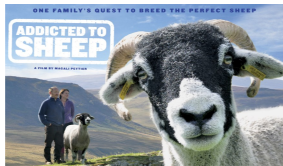
DVD of Addicted to Sheep can be ordered from our brand new online shop www.addictedtosheep.com/shop